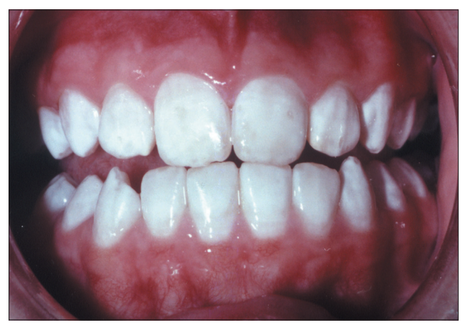
Fig 5b. The teeth of this young adolescent responded well to sodium hypochlorite treatment and have not restained 6 months after the etch/ bleach/seal approach

of the enamel with sodium hypochlorite to remove the enamel proteins can enhance the ability of acid to etch the surface, thereby improving the likelihood that resins can bond successfully to the surface.<sup>17</sup> In light of this, we have also applied the etch/bleach approach to treating yellowbrown hypominerlized lesions on molars where the enamel is often difficult to bond. Treatment of hypomineralized lesions in anterior and posterior teeth can enhance the enamel coloration and potentially improve the creation of enamel porosity from etching and subsequent bonding of either preventive (sealants) or esthetic resin materials.