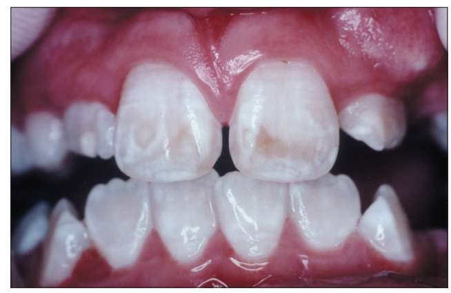
Fig 1. The central incisors and incisal tips of the emerging lateral incisors have discrete yellow-brown discolorations that the patient considered esthetically displeasing