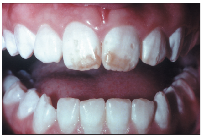
Fig 5a. Yellow-brown staining of these hypomineralized, fluorotic teeth were esthetically displeasing to this young adolescent

Treatment of enamel that has a high organic content using bonding technologies can be problematic due to the organic material present within the enamel that prevents effective etching. Studies show that sodium hypochlorite can effectively remove proteins from the enamel crystallite surfaces.<sup>16</sup> Furthermore, it has been shown that pretreatment