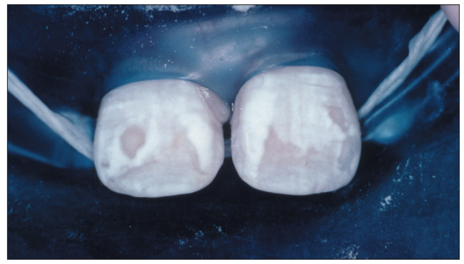
Fig 3. After a 15-minute application of sodium hypochlorite, the yellow-brown coloration has been removed and the desiccated enamel has a white-mottled appearance

Sodium hypochlorite (5%) is applied to the entire tooth surface using a cotton applicator (Fig 2). The bleach is continuously reapplied to the tooth as it evaporates. Often the discoloration can be observed to diminish over 5 to 10 minutes. If little or no change has occurred in 10 minutes, the tooth should be re-etched for 60 seconds, rinsed and bleached. The teeth may be bleached at one appointment for 15 to 20 minutes and, in some cases, benefit from