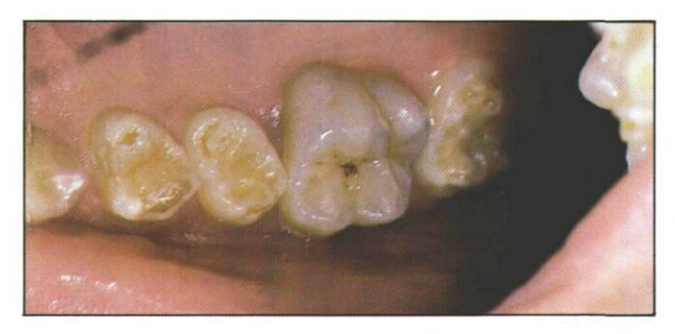
Figure 2c. Enamel hypoplasia noted in the subject described in Figure 2b. Maxillary first and second premolars and second permanent molar demonstrate total enamel hypoplasia. The first permanent molar has normal enamel except for a narrow band at the gingival margins.

Figure 2a. Enamel hypoplasia of maxillary permanent central incisors and mandibular permanent central and lateral incisors noted in a boy age seven who had the onset of advanced chronic renal failure in early infancy. The entire enamel surface is hypoplastic on all affected teeth. Discolored teeth in this subject are primary teeth.