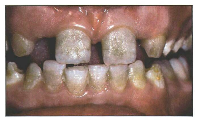
Figure 2b. Enamel hypoplasia noted in a 13-year-old boy who had the onset of advanced chronic renal failure between 1.5 and two years of age. Maxillary permanent central and lateral incisors and cuspids have normal enamel in the incisal ½ to ½, and hypoplastic enamel in the gingival ½ to %. The mandibular first premolars are entirely hypoplastic. Maxillary lateral incisors are congenitally absent in this subject. Maxillary cuspids are primary dentition and demonstrate wear and extrinsic stain.

The onset of advanced CRF between age 4.0 and 4.5 years produced the enamel hypoplasia shown in Figure 2d. As can be seen, there are bands of hypoplastic