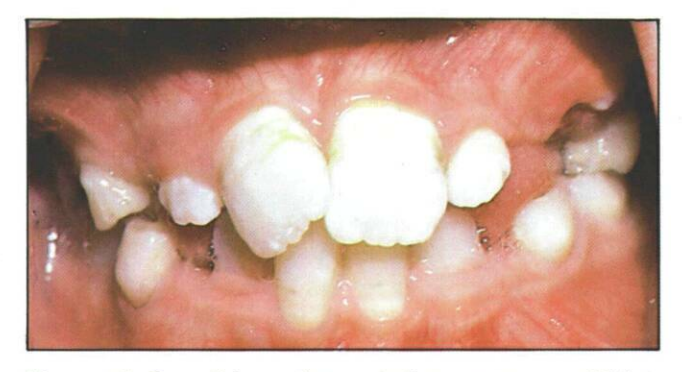
Figure 2d. Enamel hypoplasia noted in an 11-year-old boy who had the onset of advanced chronic renal failure between age 4.0 and 4.5 years. Bands of hypoplasia are evident near the gingival margins of maxillary and mandibular permanent central incisors.

Figure 2b. Enamel hypoplasia noted in a 13-year-old boy who had the onset of advanced chronic renal failure between 1.5 and two years of age. Maxillary permanent central and lateral incisors and cuspids have normal enamel in the incisal ½ to ½, and hypoplastic enamel in the gingival ½ to %. The mandibular first premolars are entirely hypoplastic. Maxillary lateral incisors are congenitally absent in this subject. Maxillary cuspids are primary dentition and demonstrate wear and extrinsic stain.