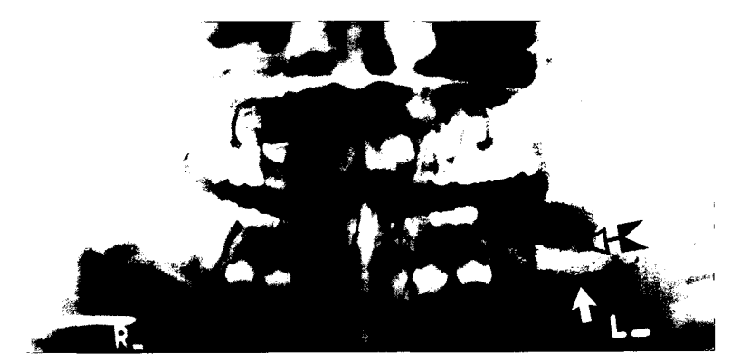
FIG 1. Panoramic radiograph of patient taken at the time of presentation reveals bone destruction and production with sequestrum formation and periosteal new bone (arrow).

because it had become loose. A panoramic radiograph at the time of presentation revealed a 3.5-cm diameter mixed radiolucent/radiopaque lesion in the left mandibular molar region (Fig 1). There was a central area of bone destruction with several small sequestra present. Surrounding the central radiolucent zone was a band of sclerosing osteitis. Examination of the inferior border of the mandible revealed a layer of periosteal new bone. Residual sclerosing osteitis existed around the apices of the extracted molar teeth. The developing mandibular left third molar had been displaced superiorly a substantial distance. A provisional