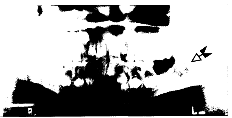
Fig 3. Panoramic radiograph of patient exposed three months following sequestrectomy showing regeneration of bone at the margin of the lesion (arrows).

This case illustrates several important points in the management of patients with suspected tuberculous osteomyelitis. In a patient with known pulmonary tuberculosis and a destructive osseous jaw lesion, tuberculous osteomyelitis must be considered. The most common cause of sequestrum and laminar periosteal new bone formation, however, is suppurative osteomyelitis (Nortjé et al. 1987). Even though the patient had no evidence of caries or periodontal pathosis, the initial therapy was extraction. If teeth are loose, there is always