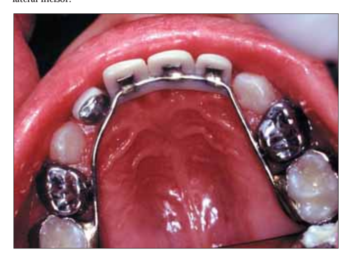
Fig 8. This appliance, replacing two maxillary centrals and a lateral incisor, was attached to second primary molars with orthodontic bands. Note longer span of archwire.