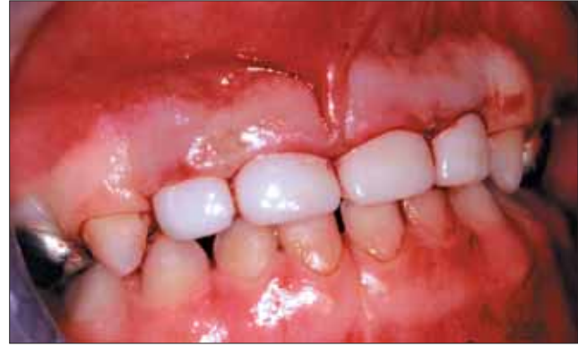
Fig 5. Anterior view. Note how the prosthetic teeth fit into the socket. Gingival tissue will heal around them giving a very natural-looking appearance to the appliance.