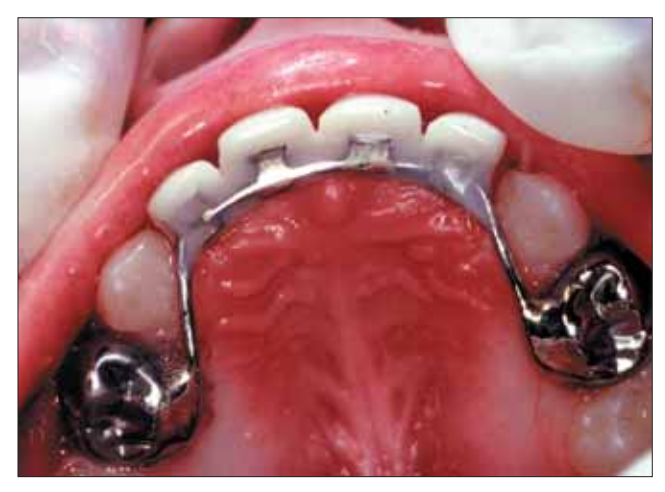
Fig 6. At follow up, note excellent oral hygiene and subsequent healing.

more aware of their image and lack of teeth and be affected by their appearance. As these children approach school age, they may have a lesser problem fitting into groups of children who are in the mixed dentition and actively exfoliating the primary incisors.7