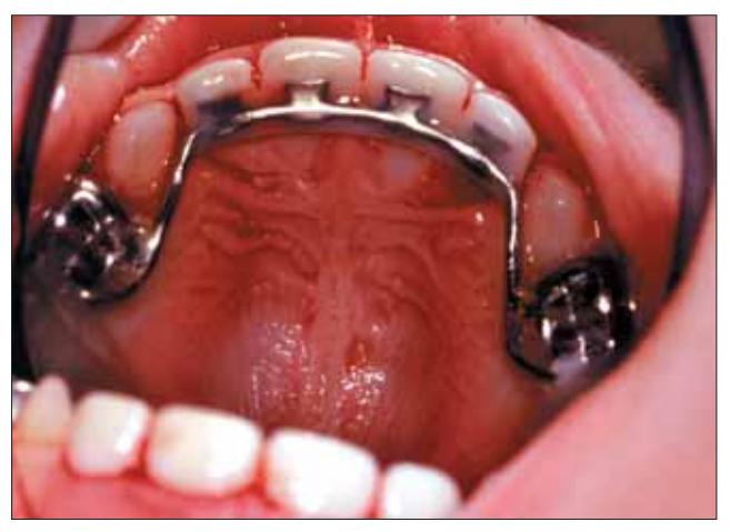
Fig 4. This appliance was placed immediately following extractions of four upper incisors. Note that each individual tooth is welded and soldered onto the archwire. The archwire is particularly stable due to its short span and rigid attachment to stainless steel crowns. The palatal acrylic button of the traditionally designed modified Nance holding arch is eliminated. This button was a source of palatal irritation and inflammation.

One study demonstrated that children who had worn dentures from early childhood exhibited no articulation errors, while those who did not exhibited articulation errors directly related to dentition. This study concluded that patients who received prosthetic dental appliances (two years is optimal as related to speech) develop better articulation skills.<sup>10</sup> Another study, by Riekman and El Badrawy, 11 found that loss of all maxillary primary incisors before age 3 years resulted in some speech problems in some children. However, the results of this study must be viewed cautiously because the study failed to have a control group and test the children's hearing, and the speech