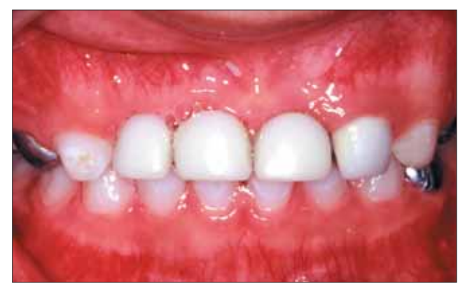
Fig 9. Anterior view. Note left lateral incisor restored with a stainless steel veneered anterior crown.

area. The round wire should be 0.036 to 0.040 inch in diameter and is attached to either the first or second primary molars with either stainless steel crowns (SSC) or prefabricated stainless steel bands.