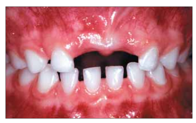
Fig 1. A Groper appliance is to be placed in this four-year-old patient, replacing two maxillary central incisors.