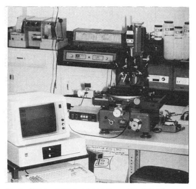
Fig 1. The measuring microscope with digimatic stage positioning and microcomputer interface.

Three extracted permanent molars which had been stored in distilled water and thymol were used to establish the precision of repeatedly recording the location of an enamel surface. None of these teeth showed visible signs of fluorosis or any other noticeable defect or decalcification. Each tooth was mounted horizontally in a small block of improved die stone with the buccal surface exposed. Each tooth then was mounted on a measuring microscope (Leitz Optical Measuring Microscope, E. Leitz Inc., Rochleigh, NJ) for recording the location of the enamel surface (Fig 1).