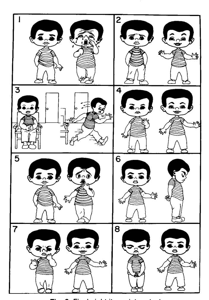
Fig. 2. Final eight item picture test.

In the first study, the subjects were 24 children aged 3-8 years, with an average age of 5½ years. Subjects were selected from a population of children presenting