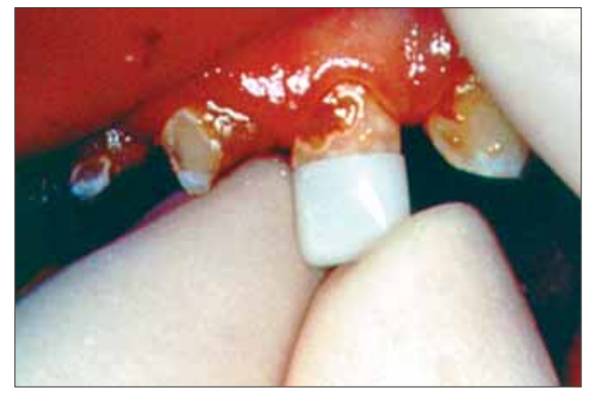
Fig 3. Seat artglass crown like strip crown or pedojacket.