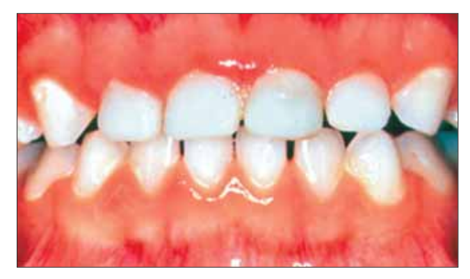
Fig 6. Two week post-op patient smile.