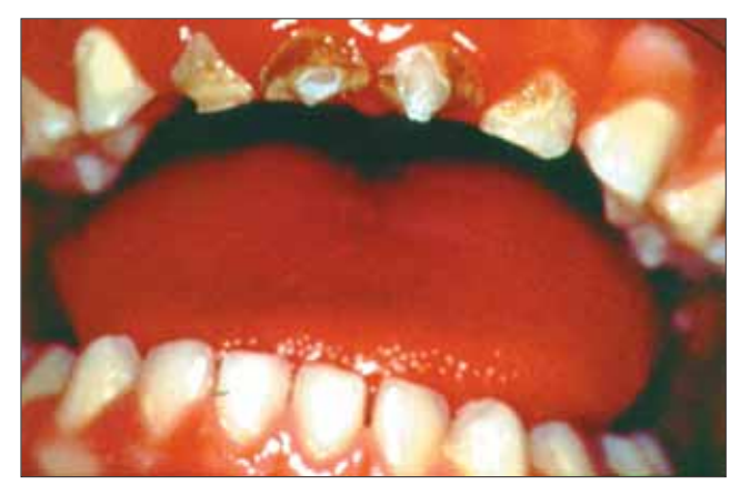
Fig 1. Pre-op photograph on 4-12-99.

The purpose of this article is to present a case report describing the placement of a preformed, indirect composite resin crown for primary anterior teeth. These crowns have recently become available in the form of resin composite shells. The technique is efficient and should provide for a durable and functional restoration.