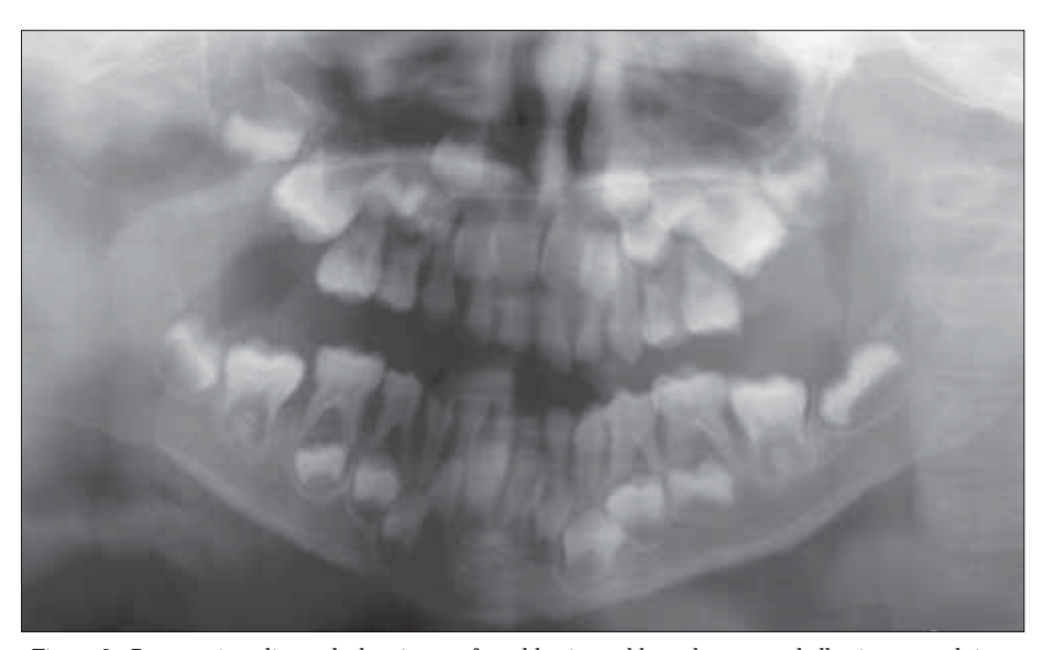
Figure 2. Panoramic radiograph showing profound horizontal bone loss around all primary teeth in a 5-year-old girl with HIES syndrome.