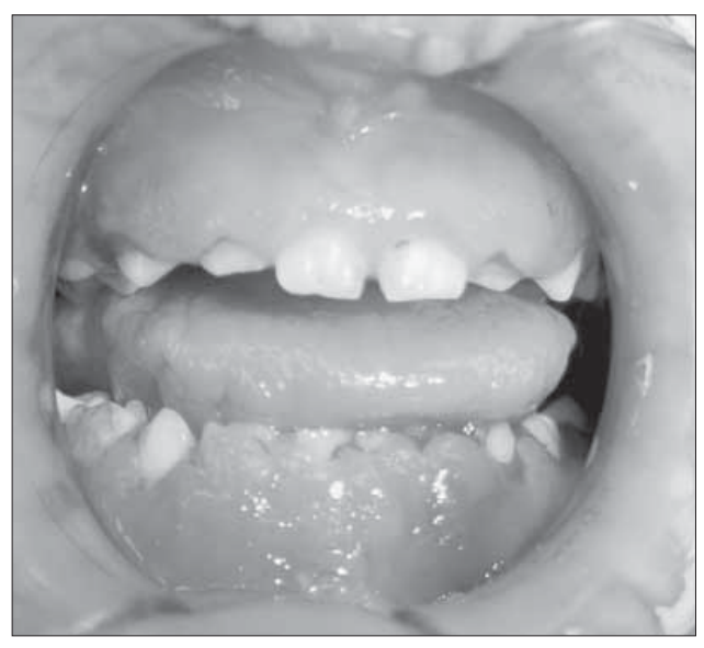
Figure 1. Red and erythematous gingiva with spontaneous bleeding in a 5-year-old girl with HIES syndrome.

The patient was re-evaluated at 1 and 6 weeks after the extractions. Her mother noticed a marked reduction in the child's oral discomfort and significant improvement in her appetite. Gingival healing was satisfactory, but regeneration of alveolar bone was not observed. Whether a period of edentulousness may prevent the recurrence of periodontitis in the permanent dentition remains to be determined with future monitoring. Prosthetic replacement of primary teeth and interceptive orthodontic treatment due to early loss of primary teeth are pending upon improvement of the patient's periodontal health.