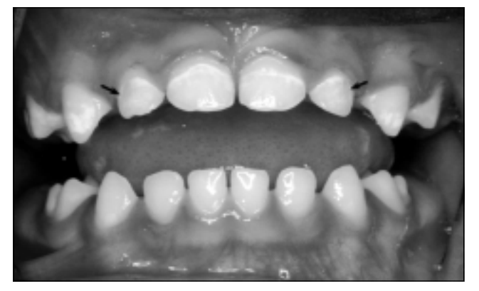
Fig 2. Child's dentition at 24 months of age. Enamel defects on the maxillary incisors, maxillary canines, and mandibular canines are evident. Two carious lesions on the labial surface of the maxillary lateral incisors have been restored with a polyacid-modified resin restoration (arrows).

in a clinical trial that examined the effect of education, selfefficacy enhancement, and frequent professional fluoride treatments on caries incidence. The longitudinal nature of these cases gives insight regarding the etiology and progression of caries in this age group, and despite intensive efforts, the difficulty in preventing it in some individuals.