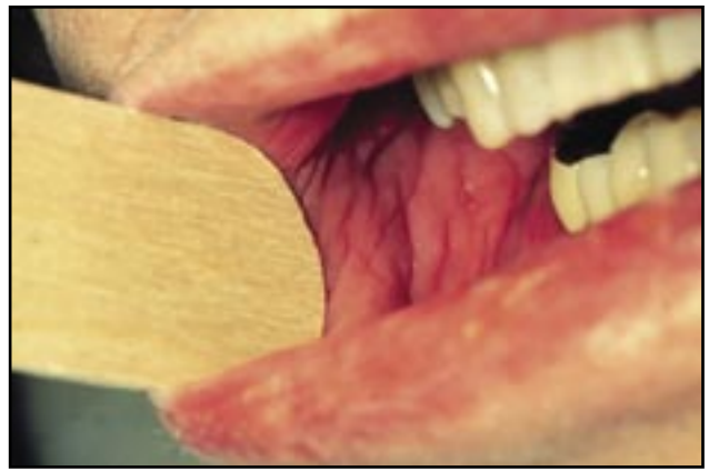
Figure 3. Presentation of a "dry mucosa" in a pateint with salivary hypofunction.

Less evident from these images is the role of saliva in alimentation (Figure 1), including the formation and swallowing of the food bolus. Some data suggest that in persons with compromised salivary flow, their choices of food changes, thereby putting their nutrition at risk.<sup>61</sup> A recent study using a mouse model in which salivary flow is markedly reduced through ablation of the water channel (aquaporin 5) demonstrated that mice fed hard food pellets consumed less, leading to a reduced growth rate; when fed a liquid diet, no change in growth was observed.<sup>62</sup> The integrity of the food bolus is maintained by the adhesiveness of the salivary secretions. While chewing is a voluntary response, available evidence indicates that the number of chews is optimized by food type - too few and the found bolus will not stick together, too many and it may fall apart. 63 What remains unexplored is whether differences in the intrinsic qualities of saliva vary among persons who display different eating habits. For example, if one's saliva allows for the formation of a food bolus with minimal mastication, does that dampen satiation leading to greater