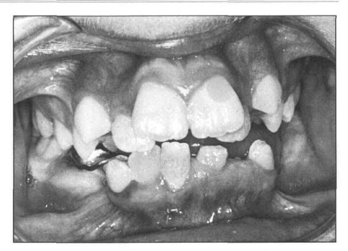
Fig 3: Hypoplastic and discolored permanent and primary teeth.