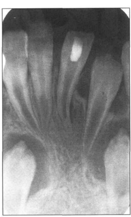
Fig 4: Radiodensity of affected teeth was reduced as compared to normal teeth; note large pulp chambers, large follicles around the canines, and small radiopaque foci in the follicles of the partially erupted lateral incisor.

Aldred 1989). However, our patient presented with a mandibular lesion. When more than one guadrant is involved. ROD can be seen on the same side of both jaws or bilaterally in either the maxilla mandible, or as in this patient (Crawford and Aldred 1989). Our case is somewhat unusual, however, in its pattern of bilateral distribution (Lustmann 1975 found that affected teeth were located on both sides of the