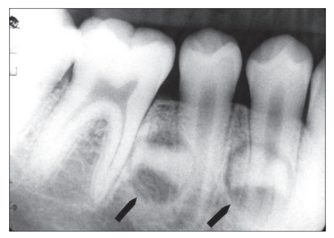
Figure 2. Supernumerary permolars in early stages of development (arrows).

Several authors have reported the recurrence of supernumerary premolars after being surgically removed. Poyton,