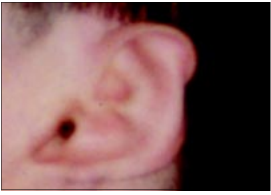
Fig 2. Ear abnormalities

delayed eruption of the permanent dentition and mandibular retrognathism. An absence of lower permanent central incisors was also described in one case. Harrison et al <sup>8</sup> reported two cases of solitary maxillary central incisor in children with CHARGE association. Grimm et al <sup>9</sup> reported taurodontism of the pulp chambers of the primary molars in a child with CHARGE association. This report describes the dental clinical findings in a child with CHARGE association.