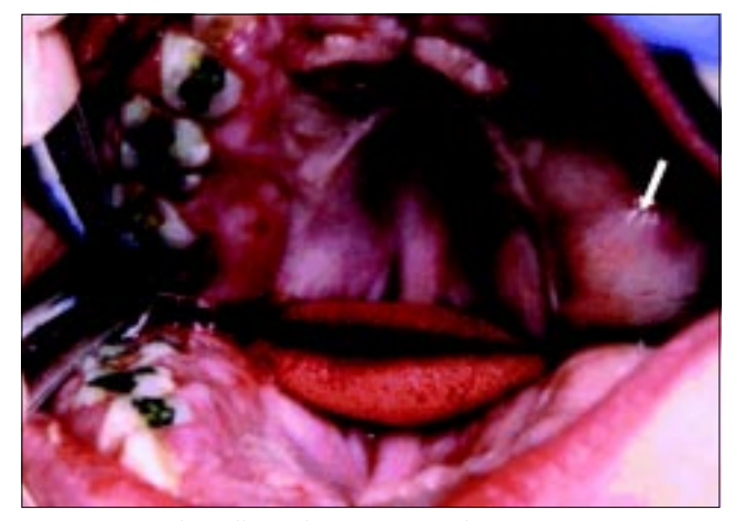
Fig 5. Unerupted maxillary right permanent molar

1. Ectopic eruption of tooth #3 (the maxillary right first permanent molar).