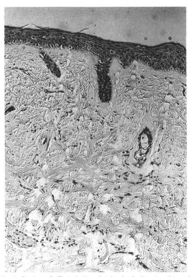
Fig 6. Section of affected skin of right cheek showing thinned epidermis, atrophy of skin adnexal structures and reteridges, dermal sclerosis with excess collagen, and avascularity (H&E, 200x).

Although the oral manifestations of systemic scleroderma have been well documented, particularly in the adult patient, there are only 2 reports in the dental