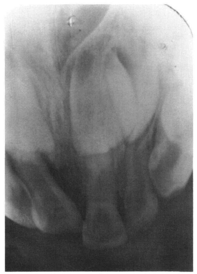
Fig 3. Periapical radiograph of the maxillary incisors taken at first detection of scleroderma. The right central incisor was loosened secondary to a fall. There is widening of the periodontal membrane and proximal bone loss between the primary incisors.

An orthopantogram revealed all permanent teeth except the third molars to be present. An anterior maxillary occlusal radiograph showed that the permanent maxillary right central incisor had a slight palatal inclination relative to the left incisor (Fig 5). No bone abnormalities were detected in those radiographs or in full-mouth periapical radiographs. In addition, the periapical films showed no evidence of an increase in periodontal membrane spaces frequently reported in diffuse scleroderma (Marmary et al. 1981). A soft-tissue radiograph revealed no evidence of calcification in the cheek lesion.