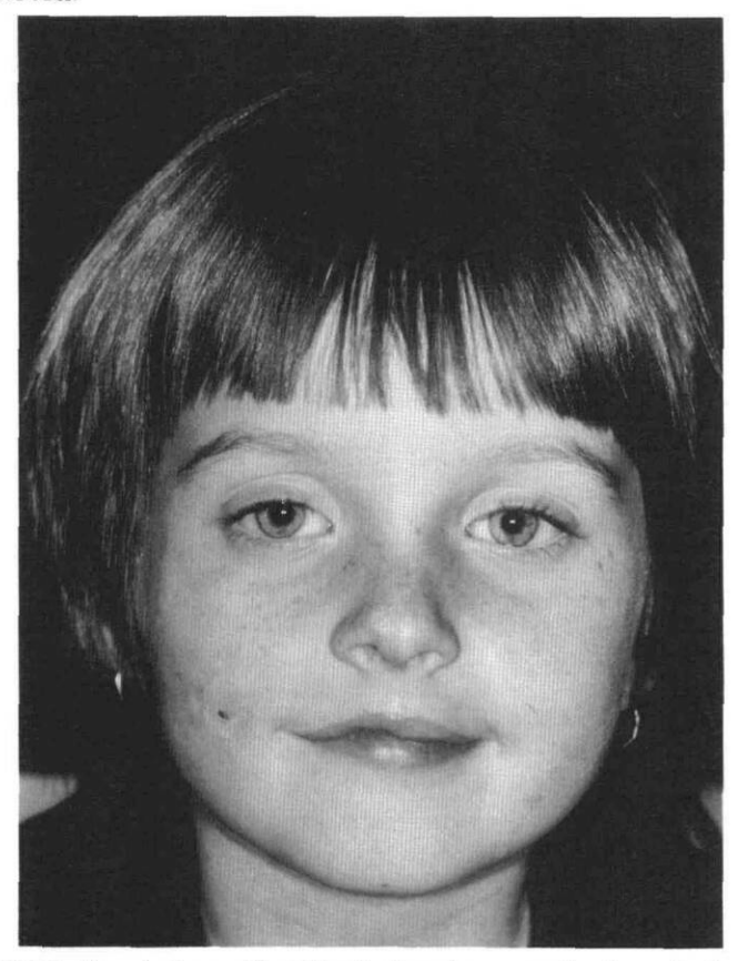
FIG 1. Two lesions of localized scleroderma on the face of a 6-year-old girl. A coup de sabre linear scar extends through the right ala and philtrum and a plaque is present on the right cheek.

She was of normal intelligence, with height 113 cm (50th percentile) and weight 17.0 kg (25th percentile). A linear, flat, white scar-like lesion, approximately 0.5 cm wide, extended from the bridge of the nose through the right ala and the right side of the philtrum of the lip (Fig 1). A 2-cm white, non-raised, indurated plaque with superficial hemorrhagic crusting (which was the site of the biopsy, Fig 2) was noted on her right cheek just below the malar eminence. No other skin lesions were apparent and no developmental dysmorphological features were noted.