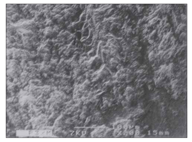
Figure 2. Scanning electron microscope image of preterm enamel showing surface enamel hypoplasia. The enamel appears rough, granular, and poorly mineralized (magnification \times 200 ). Bar represents 100 \mu m.

It is now well known that the size of dental crowns is thought to be determined by both genetic and environmental factors, but the relative importance of these influences is unclear. In previous studies, the authors reported that pre-