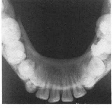
Figure 2. (right) Radiograph of mandible showing 1 × 2 cm radiolucent lesion associated with mandibular left second bicuspid.