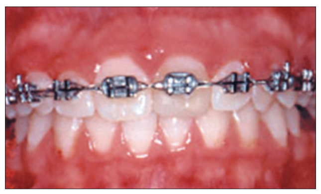
Figure 4. Clinical appearance of tooth no. 9, 5 years after restoration, showing acceptable esthetics and function.