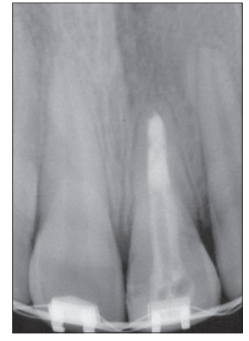
Figure 5. Five years postoperative radiograph of the completed restoration showing the Luminex post in position and a normal radiographic appearance.