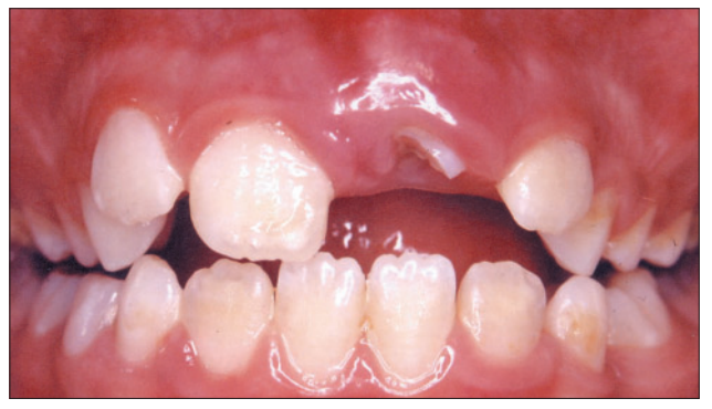
Figure 1. Intraoral view of the severely intruded left central maxillary incisor (tooth no. 9) 3 days after trauma. Notice the swelling of the gingiva around this tooth.

before re-eruption, however, endodontic access is not always achievable.<sup>2</sup> It was also suggested that delay in applying extrusive forces on the tooth might increase the likelihood of developing ankylosis in the intruded position.<sup>7</sup> The probability of a tooth deeply embedded in the bone to erupt spontaneously is minimal.<sup>2,7</sup> Therefore, observation for spontaneous eruption is recommended only in very mild intrusions.