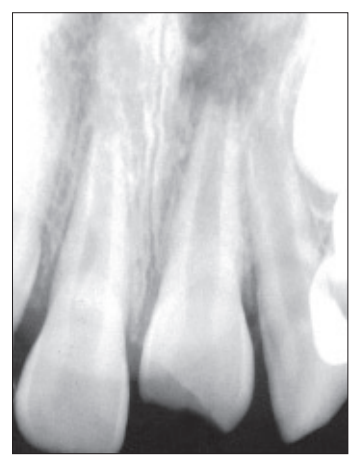
Figure 2. Periapical radiograph of the intruded tooth 3 days post trauma showing the proximity of the fracture line to the pulp and the incomplete root development (stage 5, according to Moorees<sup>14</sup>).

A healthy 7 1/2-year-old girl was referred to the Emergency Clinic of the Department of Pediatric Dentistry at the Hadassah School of Dental Medicine in Jerusalem. She had