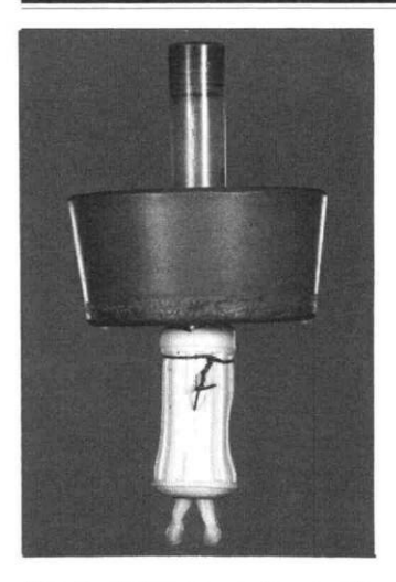
Fig 1. Primary molar tooth assembled for dye penetration of the root canals. A rubber teat holds securely at one end to achieve a tight seal. The other end of the teat is sealed around a plastic tube through which the dye is inserted. A wire tie is used to seal this section securely. Red sticky wax is applied to the apices of the tooth.

fit a 2 L flask attached to a vacuum pump (Fig 2). Red sticky wax was applied to the apical onethird of each root to seal the apical foramen (Fig 3). A drop of Safranin® dye (red) (Sigma Chemical Co., St. Louis, MO, USA) was intro-duced down the tube into the pulp chamber using a fine disposable glass pipette. Extreme care was taken to ensure that no spillage of dye occurred onto the external aspects of the tooth. A vacuum pressure of 550 mbar mercury was applied to the external root surfaces for a maximum of 5 min. As soon as the vacuum was applied, the furcation area of each tooth was