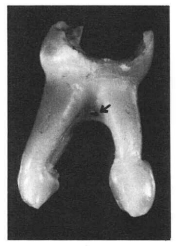
Fig 3. Accessory foramen localized in the furcation of a mandibular primary first molar.

It is of interest to analyze the location of the foramina. Table 2 (page 200) shows the distribution of the for-