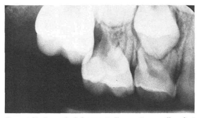
Figure 1. Radiograph of the ectopically erupting maxillary first permanent molar.

At the three-week recall the molar usually shows significant distal movement. If the permanent molar has not cleared the distal portion of the second primary molar completely, a further adjustment of one-third of the mesiodistal diameter of the permanent molar can be made