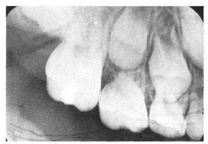
Figure 3. Radiograph of the corrected condition.

During the past two decades many methods for treating this condition (except for that of Croll and Barney<sup>11</sup>), have been tried with varying degrees of success. The new simple appliance described in this paper is a combination of many previous treatment techniques. It effectively corrects the ectopically erupting permanent molars and promotes a normal eruptive path. Since two springs are utilized, an even force from both the buccal and lingual sides of the tooth is directed at approximately right angles to the long axis of the ectopically erupting first perma-