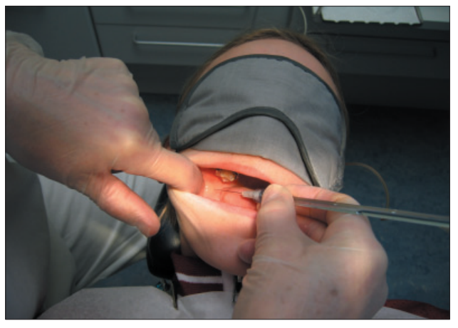
Figure 1. Clinical picture showing the blindfolding of the subjects during injection. The sound of the machine was also activated during both types of injection.