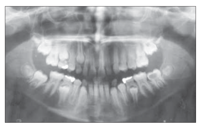
Figure 1. A large radiolucent area underneath the occlusal dentoenamel junction of the mandibular left second molar on a panoramic radiograph taken for orthodontic reasons.

The present case demonstrated an accidentally diagnosed, asymptomatic, pre-eruptive, intracoronal resorption of a mandibular second molar on a panoramic radiograph taken for orthodontic reasons.