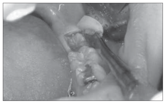
Figure 3. The gingival tissue above the unerupted molar surgically retracted, revealing the occlusal surface of the second molar.

Pre-eruptive intracoronal resorption has been previously described as located adjacent to the dentin-enamel junction, and extending into various depths of the dentin. 5,6 The dental literature generally recommends surgical exposure of the unerupted tooth—as soon as the lesion has been diagnosed radiographically—to arrest the progression of the resorptive process and prevent its penetration into the dental pulp. 2,3,5,6,11 In this case study, the extensive radiolucent area under the enamel on the unerupted tooth required an