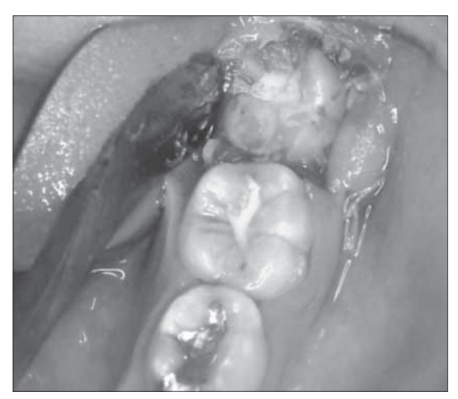
Figure 4. Cavity restoration with glass-inomer, (GC Fuji IX–GP, GC, Tokyo, Japan).