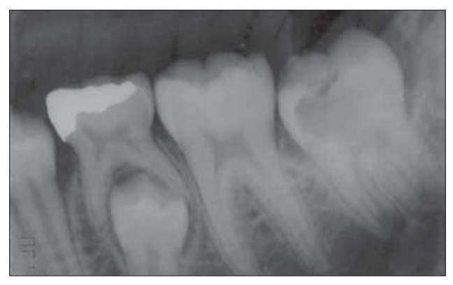
Figure 2. A periapical radiograph demonstrating the unerupted mandibular second molar, with a clear radiolucent area in the crown, extending from the occlusal surface into the dentin.