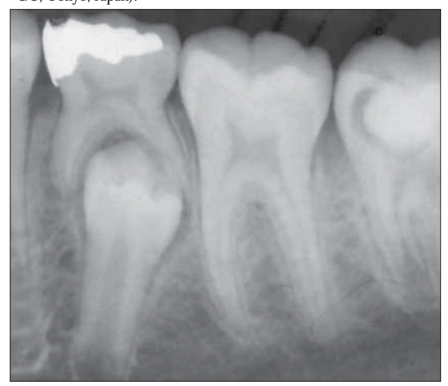
Figure 5. A periapical radiograph showing a radiolucent area underneath the restoration and on its mesial aspect.