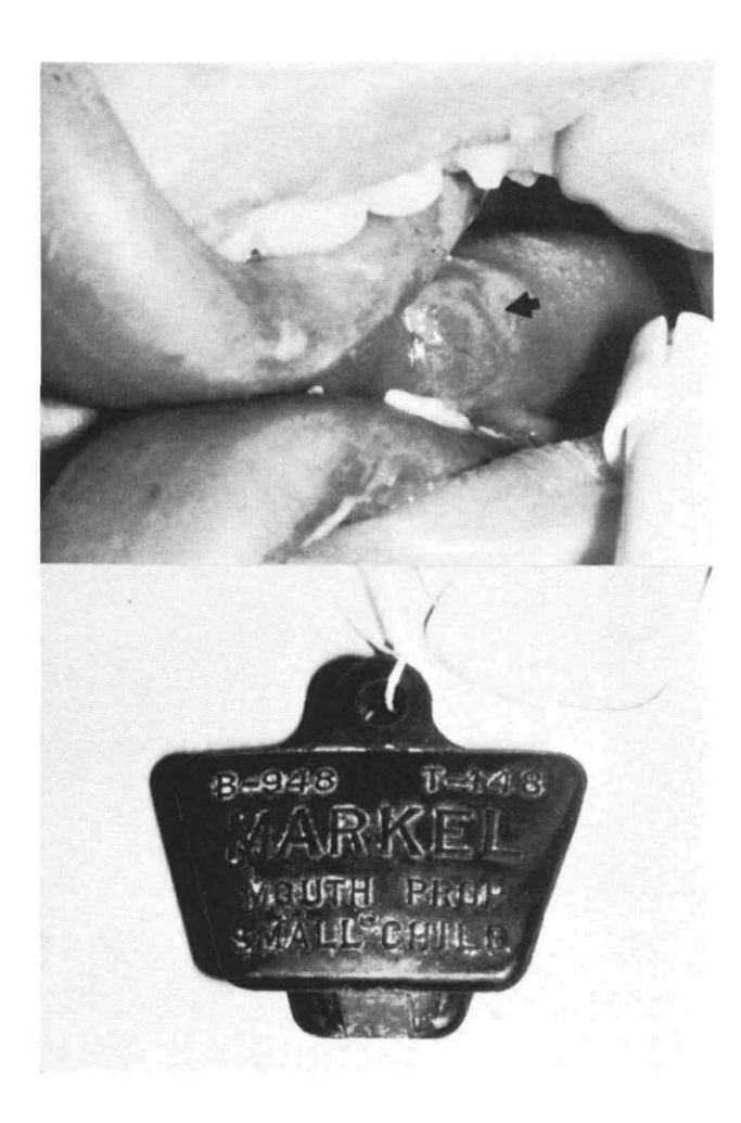
Fig 1. ( top ) Typical self-inflicted trauma in a comatose patient. Immediate relief was achieved with a ratchet (Molt) mouth prop.

Fig 2. ( bottom ) The McKesson rubber bite-block is hygienic and easy to insert.