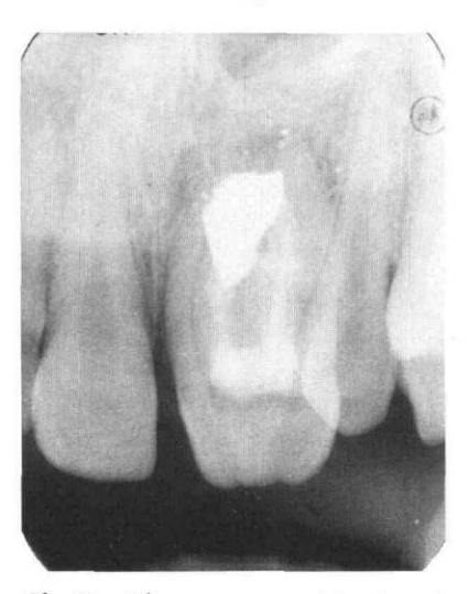
Fig 3. Three year post-treatment radiograph. Note the extent of dilacerated canals into the incisal edge.

Previous reports have indicated the occurrence of dental invaginations concurrently with other dental