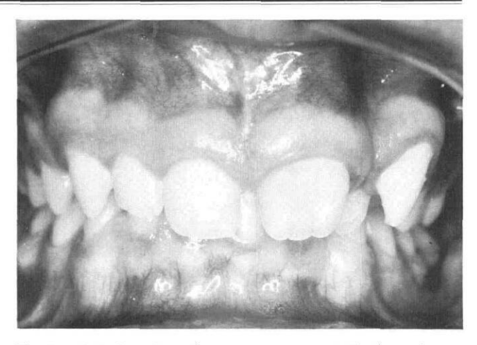
Fig 4. Anterior view three years postoperatively, prior to orthodontics therapy. Note the lingually locked left lateral incisor.

phic study suggested that excessive and prolonged activity of the cells which form the lingual pit could provide the mechanism for dental invagination (Benyon 1982). The bizarre occurrence of these anomalies in one tooth is most likely due to chance, although