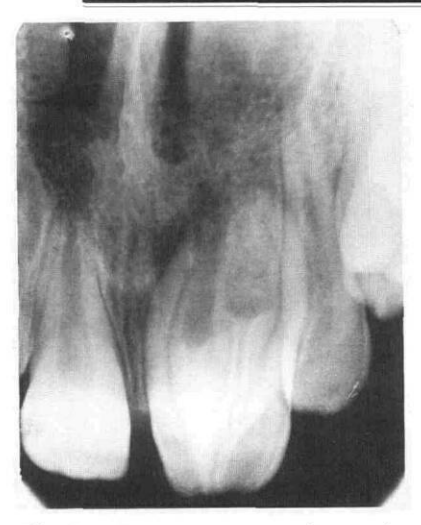
Fig 2. Pretreatment radiograph showing multiple dilacerated canals and invaginations.

divided doses, for a period of 10 days. The postoperative course was unremarkable.