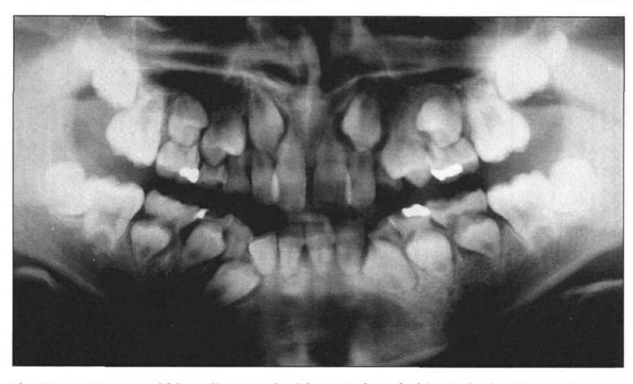
Fig 1B. An 11-year-old boy diagnosed with acute lymphoblastic leukemia at 4.8 years of age, treated with BMT at 5.4 years of age exhibiting severe disturbances in dental development.

2.2 years after TBI, no statistically significant differences in salivary secretion rate were found compared with pre-TBI values. Studies on salivary secretion in children treated for malignant diseases are few. Fromm, et al.<sup>22</sup> studied late effects in 20 children treated for soft tissue sarcomas of the head and neck. Severely reduced