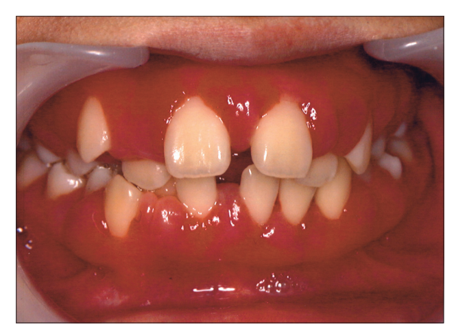
Figure 4. Intraoral view at age 10 (neutropenic period).