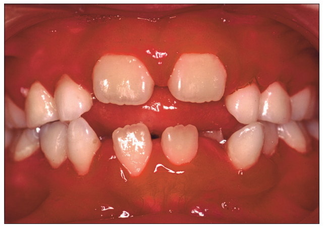
Figure 2. Intraoral view at initial examination (6 years old, neutropenic period).

weeks after the initial visit showed severe bone loss around the mandibular anterior teeth and moderate bone loss around the maxillary and mandibular primary molars. The first permanent molars appeared to have suffered no bone loss (Figure 3). All the primary and permanent teeth present had periodontal pockets with a depth of 3 to 5 mm, and lesions in the buccal mucosa had developed. The patient stated that she had difficulty brushing her teeth because of gum soreness. She tried to wipe her teeth by using gauze during every neutropenic phase. She had eaten mainly rice gruel, pudding, and ice cream for meals, and, due to the mouth soreness, she could not even rinse out her mouth. Instead, she held the water in her mouth for a moment before expectorating.