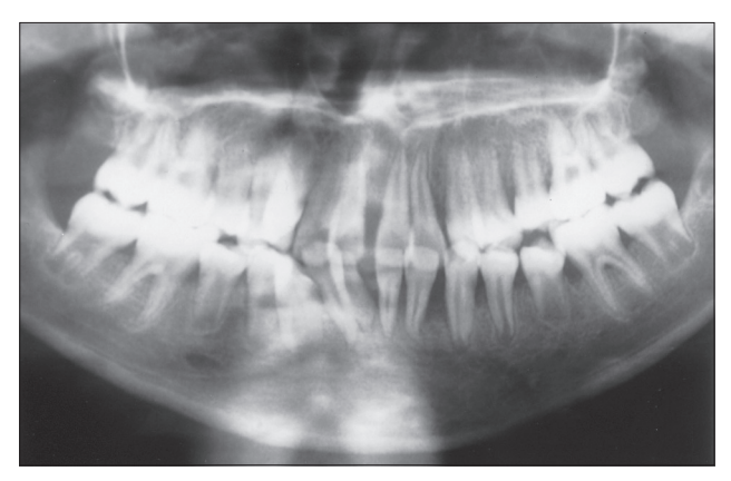
Figure 5. Panoramic radiograph at age 10.

gingiva around the maxillary and mandibular incisors was severely inflamed, hyperemic, and hyperplastic. The gingiva in some areas covered half of the teeth. Alveolar bone resorption was noted in the mandibular first permanent molars by age 10. It was judged impossible to improve the periodontal status because loss of supportive tissue had advanced, in spite of the periodic recalls. A periodontal specialist performed a gingivectomy surgically under local anesthetic at the time of the nonneutropenic phase. Because deepened pockets persisted around the maxillary and mandibular permanent central and lateral incisors and had