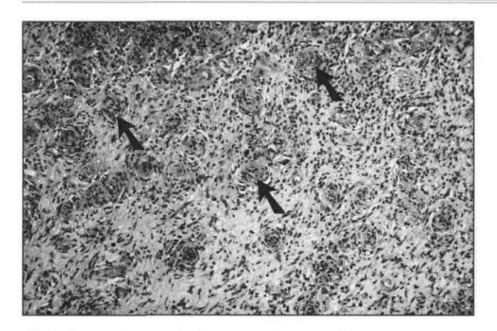
Fig 2. Photomicrograph demonstrating granulation tissue stroma with prominent vascularity. Arrows indicate the most prominent areas of proliferating blood vessels. H & E stain, original magnification x33.

Ten days after surgery, the excision site was healing adequately, and there were no signs of recurrence. The postsurgical course was uneventful. One month later, the patient returned for a follow-up evaluation. The excision site had healed fully, with no recurrence of the lesion. A raised area at the surgical site was normal in color and there was no increased vascularity, as would be seen with a recurring pyogenic granuloma (Fig 3).