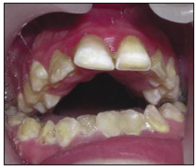
Figure 1. Anterior view demonstrating severe anterior open bite and an increase in overjet. Notice the heavy accumulation of plaque and increased saliva secretion.

The purpose of this case report was to present the dental findings and treatment of a patient with trisomy 9 mosaicism and a description of the intraoral anomalies are presented.