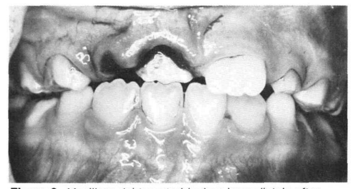
Figure 3. Maxillary right central incisor immediately after repositioning. Note primary right lateral also was extracted prior to manipulation of the permanent tooth.

A surgical curette was used to reposition the permanent tooth. The curette was positioned on the lingual aspect of the tooth and close to the soft tissue where there was sufficient tooth structure bulk. Next, a light but deliberate, steady force was applied to the tooth until movement was noted. Care was taken to make sure no soft tissue within the extraction site prevented tooth repositioning. Force was applied again and again to advance the tooth slowly tipping it into its new position. Occlusion was checked intermittently for progress. Once an overbite relationship was reached with the opposing mandibular incisor, the repositioned tooth was held until a clot formed. This clot, along with the occlusion, steadied it in its new position (Figure 3). The patient was