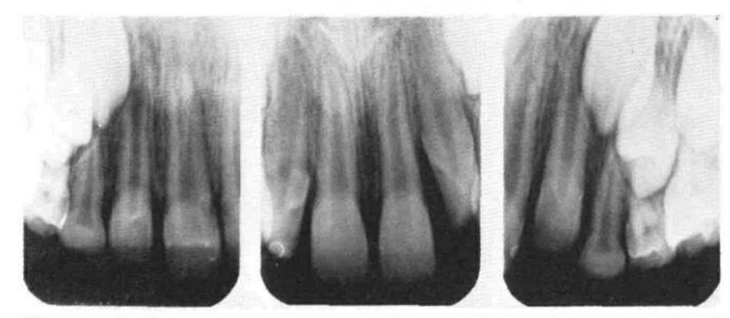
Figure 5. Ten-month postoperative periapical radiograph of maxillary anterior teeth. Root formation of the repositioned central incisor has continued normally.

Case selection closely fits the criteria for tongue blade therapy, but rapid correction is indicated when the child is unable or unwilling to cooperate. If the criteria for this