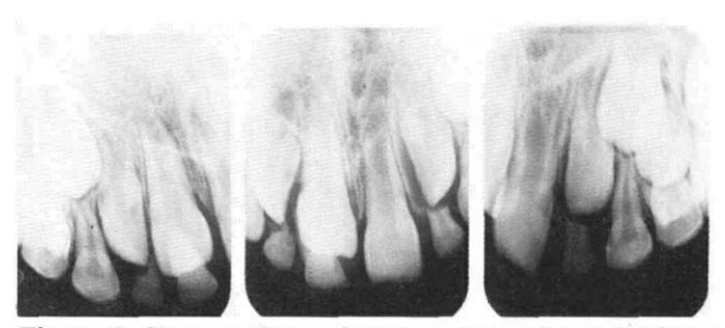
Figure 2. Preoperative periapical radiographs of maxillary anterior teeth showing obliterated pulp chamber and delayed resorption of right primary central incisor and deflection of its permanent successor.

Periapical radiographs showed the root canal of the primary right central incisor was obliterated (Figure 2).