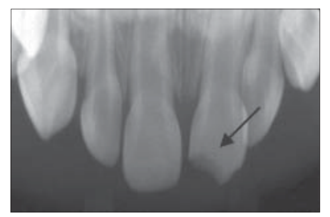
Figure 1. Preoperative posttrauma radiograph of the maxillary primary incisors of a 3-year-old child, 3 hours after injury. The child had sustained a fall and subsequently fractured the left primary central incisor. Note the involvement of the right pulp horn and its exposure.

A case of PP and its 2-year follow-up are presented and illustrated in Figures 1 to 4.