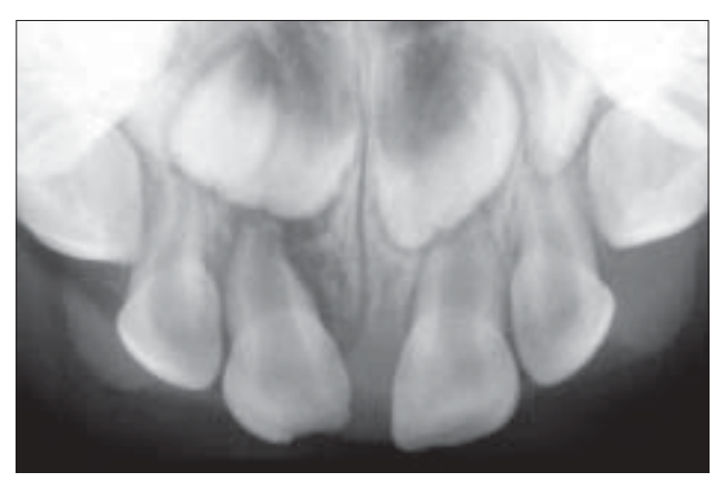
Figure 12. Periapical radiograph evidencing external root resorption, bone loss around the root of the necrotic tooth, and possible involvement of the permanent tooth follicle. The tooth was extracted.