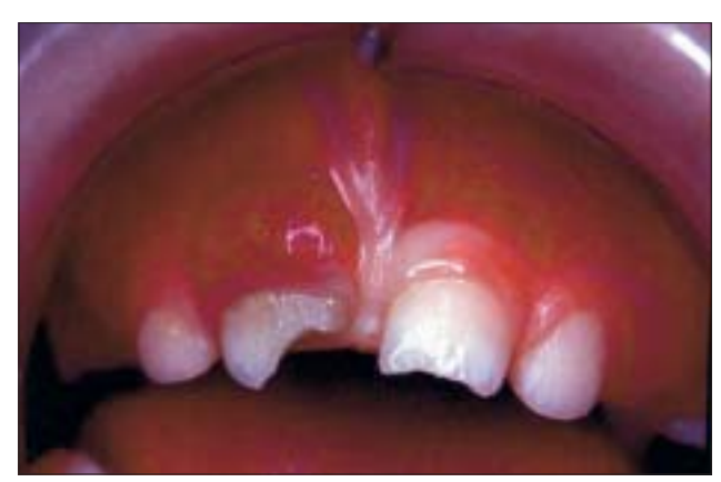
Figure 11. Clinical photograph of a 27-month-old child who had sustained a complicated crown fracture that was not treated. The child appeared 6 weeks later with a parulis above the involved tooth. The tooth was extremely mobile.

The clinician should consider the need for space maintenance following extraction of primary incisors. While space maintenance in the posterior region is an important consideration when there is early loss of primary molars, the anterior segment appears to be stable from canine to canine–even with the early loss of several incisors–with no net loss of space from canine to canine.<sup>25</sup> Occasionally, especially in a crowded dentition, if 1 or more incisors are lost, there may be some rearrangement of space between the remaining incisors, but no space maintenance is usually required if the loss occurs