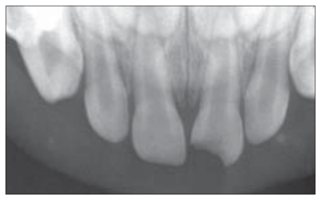
Figure 5. Occlusal radiograph immediately following trauma resulting in a complicated crown fracture with a large pulp exposure greater than 2 mm in the left central incisor. The 2-year-old child was treated under conscious sedation, and a cervical formocresol pulpotomy was performed followed by IRM placement and composite-resin strip crown.