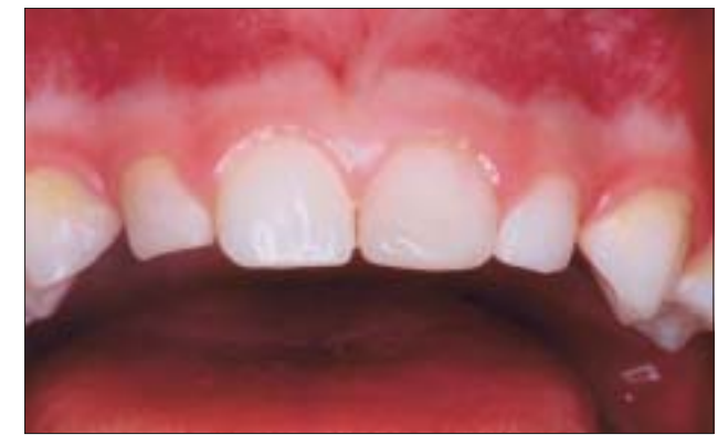
Figure 4. Clinical photograph 2 years following treatment. The restored tooth appears to have retained its excellent shape and color showing good gingival health and no adverse signs.