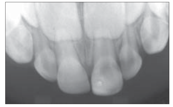
Figure 3. Two-year follow-up after the initial treatment. No pathosis or periapical areas are present in the treated tooth. Note the calcific metamorphosis of the adjacent, nontreated incisor.