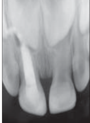
Figure 9. Periapical radiograph of an 18-month old child who 1 month earlier had fractured both central incisors with pulp exposure of the right incisor. Note the breakdown of the marginal bone due to the infection. The necrotic tooth underwent pulpectomy. Both incisors were restored with composite-resin strip crowns.