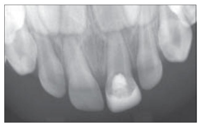
Figure 6. Radiograph exposed 18 months after treatment. Although it appears that development of the pulpotomized tooth has stopped, no pathosis or periapical areas are present.