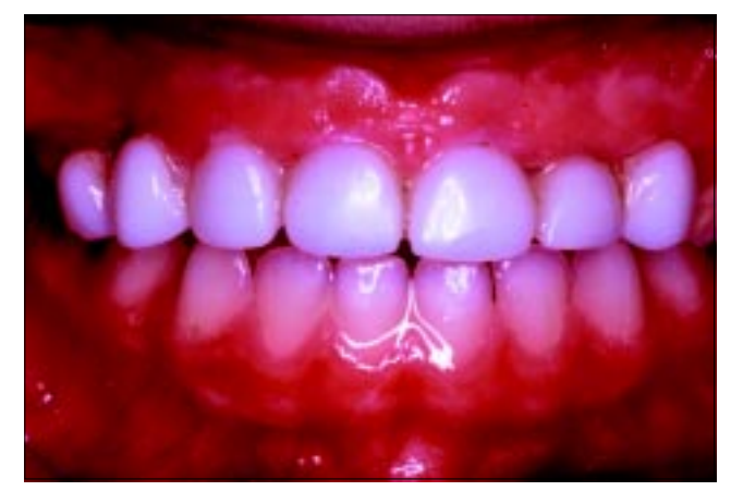
Fig 4. Intraoral view demonstrating the appliance after two years of use

Two weeks later, the child returned for appliance cementation. The appliance was similar to a Nance holding arch, but had plastic teeth processed onto the wire instead of a palatal acrylic button in the rugae area (Fig 3). The round wire was thick and rigid (0.040 inch in diameter) and was attached to the first and second primary molars with prefabricated stainless steel bands. Each individual tooth was welded and soldered onto the archwire. Although the arch wire had a relatively long span, it was particularly stable due to its unique fabrication and rigid attachment to the bands. The palatal acrylic button of the traditionally designed modified Nance holding arch was