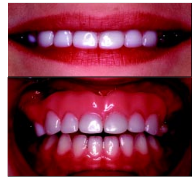
Fig 7. Anterior extraoral (above) and intraoral (below) views of the appliance in situ

appliance's retention consisted of a labial flange extending into the labial vestibulum and orthodontic clasps held into place with the composite buttons on the molars. The child adapted well to the appliance and was placed on six-month recalls.