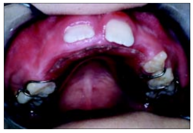
Fig 9. Anterior/occlusal view of the patient at six-year follow-up. An acrylic removable appliance is functioning as an interim space maintainer.

had worn dentures from early childhood exhibited no articulation errors, while those who did not exhibited articulation errors directly related to dentition. This study concluded that patients who receive prosthetic dental appliances (two years is optimal as related to speech) develop better articulation skills.<sup>8</sup> Another study<sup>9</sup> found that loss of all maxillary primary incisors before age 3 years resulted in some speech problems in some children. While the data is incomplete, appliances for children under 3 years of age that have not yet developed their speech skills (children over 4 years will usually compensate for the tooth loss and not exhibit any long-term speech disorders) should be highly considered.