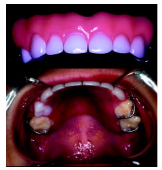
Fig 6. At age four-and-a-half, it was determined that the child was mature enough to adapt and care for a removable appliance. Anterior (above) and intraoral occlusal (below) views of the removable appliance.

Six months later the patient returned with red hypertrophic gingival inflammation. The appliance was removed and strict oral hygiene instructions were given. Five days later, the gingiva had improved and the appliance was recemented. The patient continued to return for recall examinations at 4- to 6month intervals (Figures 4, 5). At age four-and-a-half it was determined that the child was mature enough to adapt and care for a removable appliance and a decision was made to replace the fixed appliance with a removable one (Figures 6, 7). Composite build-ups were placed on the buccal aspects of the molar abutment teeth to aid in retention of the appliance. The