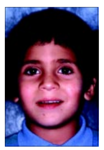
Fig 5. Facial view of the appliance demonstrating the positive adaptation of the child to the appliance

tient was 34-months old (Fig 2). The option of the placement of a fixed pedo-partial appliance (modified Nance holding arch) was discussed and consent was obtained for treatment. Prefabricated stainless steel bands (3M Unitek<sup>TM</sup> pedodontic molar bands, 3M Unitek<sup>TM</sup> Dental Products, Monrovia, CA) were fitted on the right maxillary second molar and the left maxillary first molar (first molars are preferred as abutments over second molars due to a shorter wire span and less potential interference with erupting six-year molars ). An alginate impression with the bands in place was taken. Although the child was less than cooperative, an effort was made to take a mandibular alginate impression and wax bite registration.