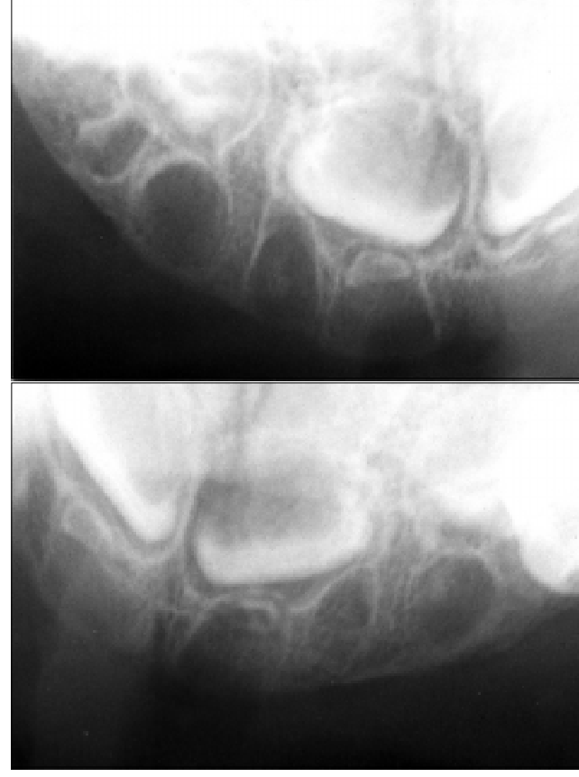
Fig 1. Right (above) and left (below) occlusal radiographs demonstrating empty avulsion sockets of all incisors, canines and right first primary molar. Note residual root apex of right central incisor. Also, it appears that both permanent lateral incisor tooth follicles are missing. Radiographs were exposed adjacent to the traumatic incident.

when a primary tooth is injured. The effect may be either direct or indirect: Directly, for example, at the time of avulsion the apex of the primary tooth may damage the tooth follicle of the developing permanent tooth. Indirectly, for example, when a primary tooth becomes non-vital, periapical infection may damage the immature labial enamel of the underlying permanent tooth.<sup>4</sup>