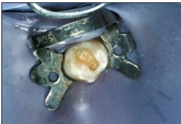
Fig 8. Bonding was applied according to manufacturer's instructions, care being taken to moisten the etched surfaces prior to bonding application.