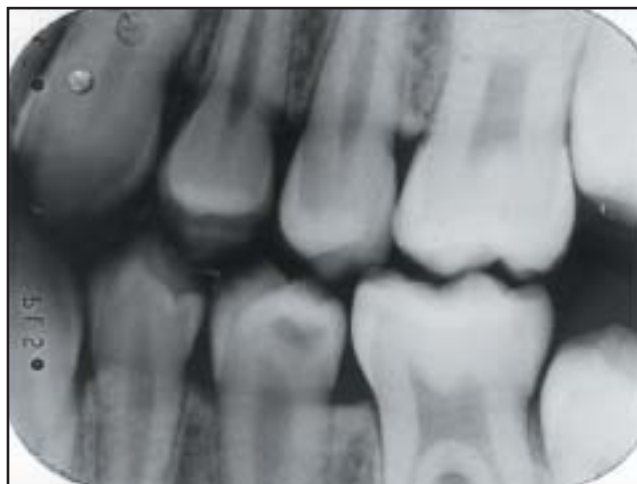
Fig 1. Bitewing radiograph taken six months after placement of fissure sealant on left mandibular second premolar. Note large radiolucent lesion in the dentin in the distal coronal portion of the tooth under intact enamel structure. The pulp horn is slightly recessed under the lesion.

The etiology of PICRL remains a subject of controversy. Suggested causes include apical inflammation of primary molars (relevant only to PICRL in premolars) and dental caries. The most likely hypothesis is that the defects are acquired as a