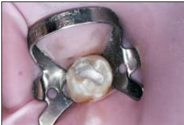
Fig 5. An amalgam interim restoration was placed. The amalgam filling was chosen due to the following qualities: 1) Ease of future radiographic diagnosis due to its superior radiopacity; 2) Excellent marginal seal with minimum microleakage; 3) Ease of its removal without reducing healthy cavity walls; 4) The patient is motivated to return for completion of the indirect pulp cap and placement of a tooth colored final restoration.