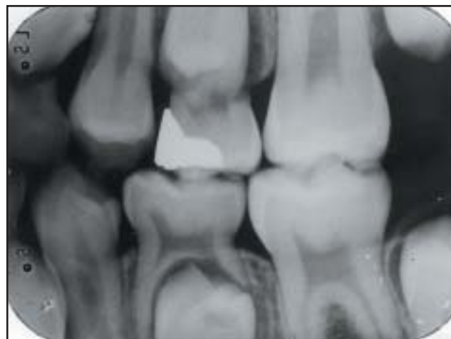
Fig 2. Bitewing radiograph taken one and half years prior to Figure 1. A retrospective viewing of this radiograph showed the second primary molar undergoing physiological resorption and a slightly rotated succedaneous premolar underneath. A radiolucent area was now observed on the distal part of the premolar crown. This area when compared with Figure 1 seems smaller and less radiolucent. At the time of exposure of this earlier bitewing, this finding was misdiagnosed by the clinician and was attributed as an artifact related to the rotation of the premolar.