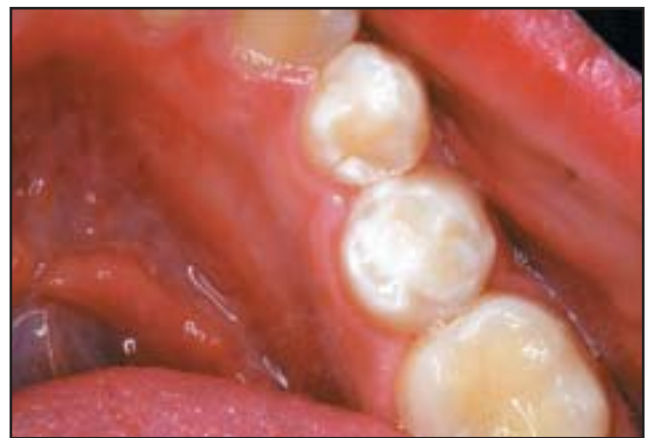
Fig 10. The final restoration.