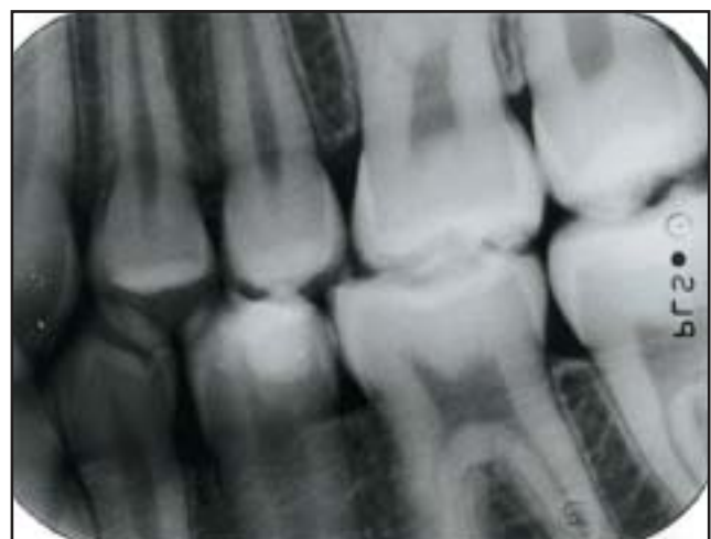
Fig 11. Post-operative bitewing radiograph two months following treatment.