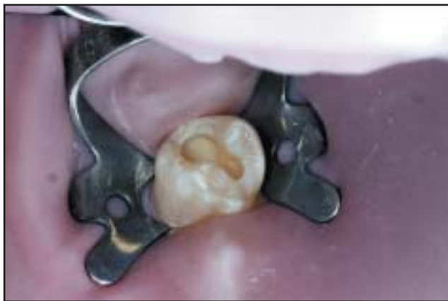
Fig 4. An indirect pulp capping procedure was performed with Vitrebond™ (3M Dental Products, St. Paul, MN Dental Products, St. Paul, MN), a light hardened resin-modified glass ionomer.