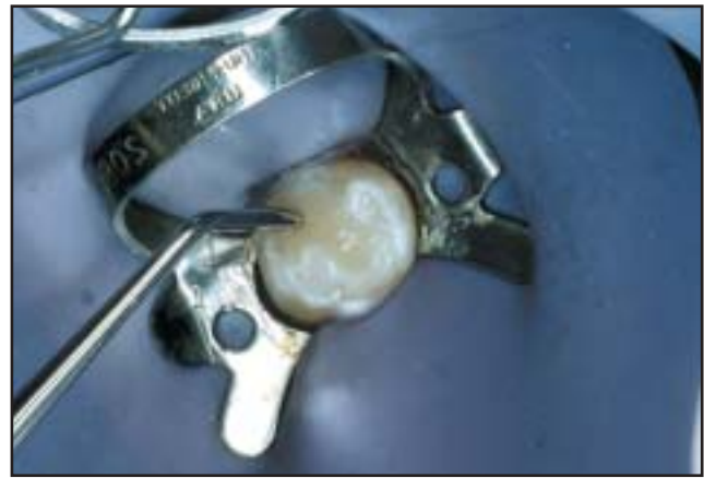
Fig 9. A flowable composite (UltraSeal XT ® plus ™ , Ultradent Products ® , South Jordan, Utah) with fluoride was applied to the floor of the cavity. The tiny fibered inspiral brush syringe tip allows minimal air entrapment. Following curing, a resin composite (Z100 ™ , 3M Dental Products, St. Paul, MN) was placed and compressed into place.