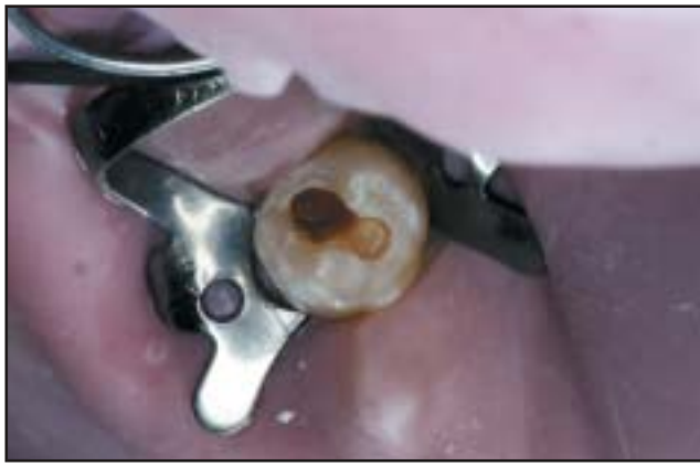
Fig 3. Further excavation revealed deep soft dentin. Careful removal of soft dentin was obtained leaving a thin layer of brown dentin.