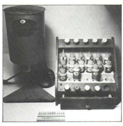
Figure 5. Pyroplast materials and curing unit.

ways to the Isosit veneer, except that it is made of acrylic resin. It can probably be used with equal results, and under similar demanding esthetic conditions.