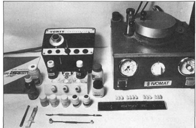
Figure 4. Isosit materials and curing unit.

<sup>f</sup>Vivadent Company, Tonawanda, NY.