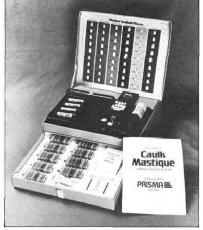
Figure 3. Caulk's Mastique laminate veneer kit.

ly. Some commercial laboratories will do the initial preparation of the Mastique veneers, saving the dentist any preparation time.