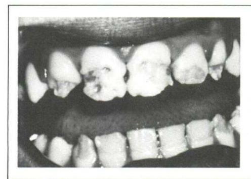
Figure 6. Severely hypoplastic and stained anterior teeth before (left) and after placement of laminate veneers. (see page 36)

There is a concern that every dentist using laminate veneers must be aware of, however. That is, the possibility of inflammatory gingival tissue changes. All of the laminate veneers, as described, add thickness to the facial surface of the tooth. This thickness is often necessary to mask out a very dark host tooth. In addition, the dark discoloration in many of the cases we see is often most intense in the gingival third of the tooth. Therefore, it is necessary to work toward achieving an acceptable balance.