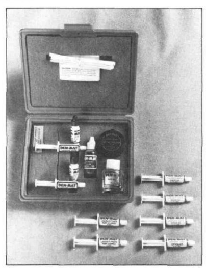
Figure 1. Den-Mat laminate paste kit.

Preformed laminated veneers are prepared in the <sup>°</sup>Den-Mat, Inc., Santa Maria, CA.