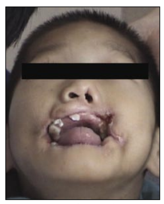
Figure 1. Facial photograph of patient's elder brother (Lesch-Nyhan syndrome), showing broad tissue destruction on the perioral tissues. Most of his permanent teeth had already been extracted to prevent further tissue destruction.

gingivitis, the remaining intraoral soft tissues were within normal limits. Radiographs were not available.