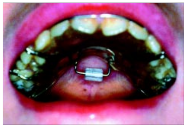
Fig 4. Bead can be placed in the middle of the palate according to the patient's swallowing pattern.

These individuals believe that if the child wears the appliance all the time, he/she will become resistant to the effect. Others believe the child should wear the appliance all the time, and if he/she becomes resistant to the appliance, the bead can be moved to give the tongue a new place to seek. Both approaches have been used for the patients at TSR, and both have seemed to work equally well. One patient did become resistant to the appliance over time and began to drool slightly. A