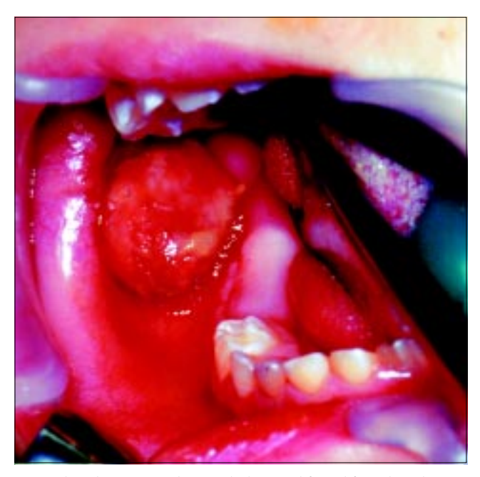
Fig 1. Clinical appearance showing the herniated fat pad from the right