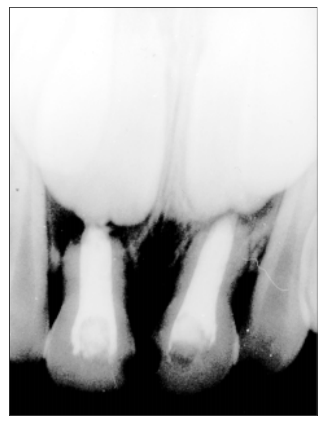
Fig 4. Radiograph of the premaxilla exposed two years and seven months after the injury. Note the continuous PDL with slight resorption of the roots and filling material and some expansion of the dental follicle of the permanent teeth.

achieve the child's full cooperation during performance of the dental treatment. The involved teeth and surrounding tissues were anesthetized by local infiltration of 1 ml of 2% lidocaine with adrenaline 1:100,000. The teeth were repositioned using thumb and finger as described by Andreasen and Andreasen.<sup>1</sup> The maxillary central incisors were then splinted to the adjacent laterals with composite resin using the acid-etch technique.