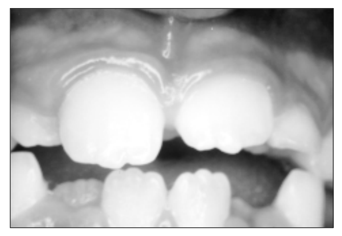
Fig 6. A clinical radiograph of the maxillary permanent central incisors. Note the mild white opacities in the enamel close to the incisal edge in both teeth.

Damage to the supporting tissues has several aspects. Rupture of the PDL and fracture of the labial bone plate result in increased mobility, discomfort, and even pain during mastication. Splint of the injured teeth to adjacent healthy teeth prevents possible exarticulation, prevents pain, and allows their exposure to physiologic forces that regularly exist in the oral environment. These forces were found to help in reconstituting the injured PDL.<sup>7</sup> Rupture of the gingival fibers surrounding the injured teeth allows invasion of oral microorganisms through the gingival sulcus and along the root, infecting the PDL and interfering with the healing of the supporting tissues. Strict oral hygiene and antibiotic therapy should alleviate this problem. Rupture of the PDL on one side of the