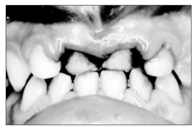
Fig 1. Clinical view showing both maxillary primary central incisors in cross bite with the mandibular incisors short after the injury.

Relation of the crown will create occlusal interference. No such displaces of the crown displaces of the maxillary presence of the crown displaces it palatally pushing the root apex labially and away from the developing permanent tooth bud. When the child has normal relations between the dental arches (i.e. the incisal edge of the mandibular incisors are in contact with the palatal aspect of the maxillary incisors) or al displacement of the crown will create occlusal interference. No such disturbance may occur when an open bite or an increased overjet exists prior to the injury.