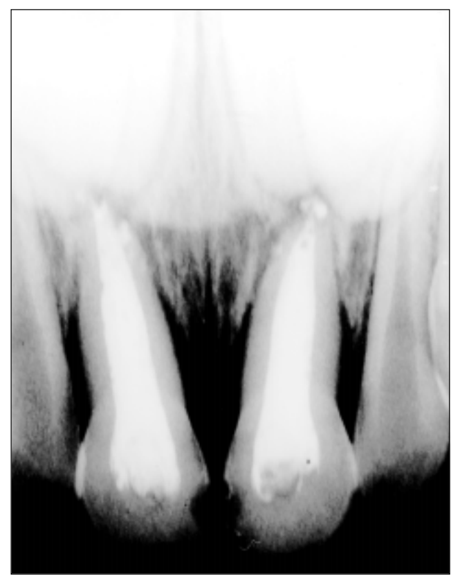
Fig 3. Radiograph of the premaxilla exposed immediately after the root canal treatment in both maxillary primary central incisors.

achieve the child's full cooperation during performance of the dental treatment. The involved teeth and surrounding tissues were anesthetized by local infiltration of 1 ml of 2% lidocaine with adrenaline 1:100,000. The teeth were repositioned using thumb and finger as described by Andreasen and Andreasen.<sup>1</sup> The maxillary central incisors were then splinted to the adjacent laterals with composite resin using the acid-etch technique.