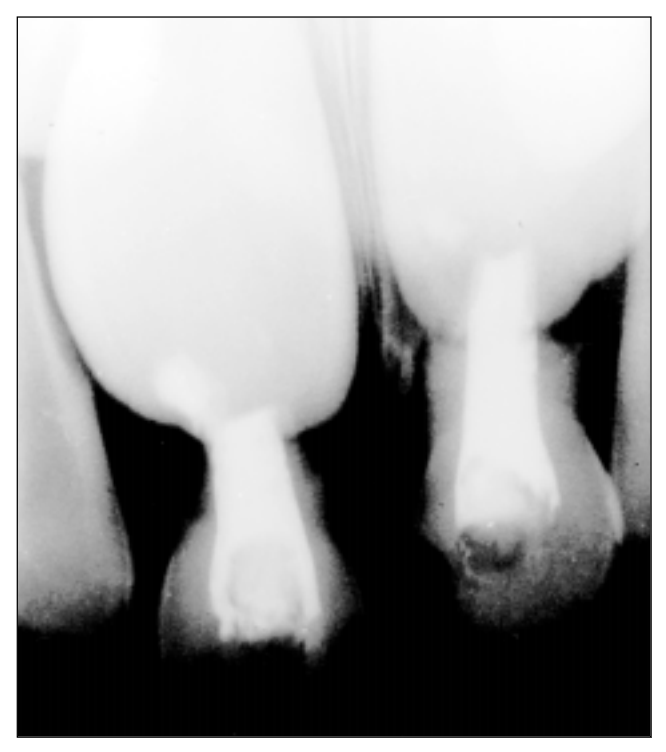
Fig 5. Radiograph of the premaxilla exposed three years and eight months after the injury and shortly before natural exfoliation.

tent of iodoform in the root filling material, but the mother rejected suggestions to improve the esthetic appearance of the teeth. Radiographs exposed two years and seven months after the injury showed continuous PDL with slight resorption of the root apex and the filling material and some expansion of the dental sac of the permanent tooth (Fig 4).