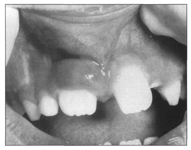
Fig 1. Pretreatment tissue condition.

Following his initial examination, prophylaxis, and topical fluoride application, appointments were scheduled for mucocele excision, sealants, and restorative care. An excisional biopsy was accomplished and the clinical impression of mucocele confirmed by histo-