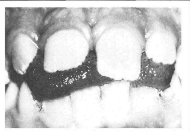
Figure 3. The teeth in occlusion showing the anterior open bite and the tongue position at rest.

try to explain the loss of the fragment in the tongue. The parents reported that they had previously noticed that the child's tongue was prominent. On examining his teeth in occlusion it was found that he had a small anterior open bite, with the tongue lying between his upper and lower incisors (Figure 3).