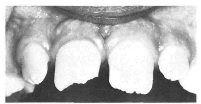
Figure 2. The traumatised incisor showing the missing mesio-incisal fragment.

try to explain the loss of the fragment in the tongue. The parents reported that they had previously noticed that the child's tongue was prominent. On examining his teeth in occlusion it was found that he had a small anterior open bite, with the tongue lying between his upper and lower incisors (Figure 3).