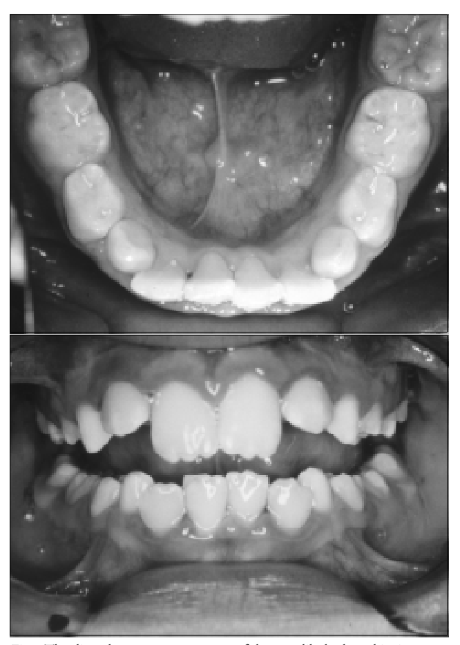
Fig1. The slipped contact arrangement of the mandibular lateral incisors

This incisor arrangement has been considered to have an undesirable effect on future development.<sup>7</sup> This is because no relief of incisor crowding is expected after the mandibular lateral incisors erupt.<sup>3</sup> Furthermore, no intercanine width increase is expected at the exchange of the primary for permanent canines.<sup>3-6,8</sup> We observed the course of slipped contacts over time, evaluating intercanine width, and found slipped contacts to have a desirable effect on future development. Theoretical explanations for these findings are presented, as well as clinical implications.