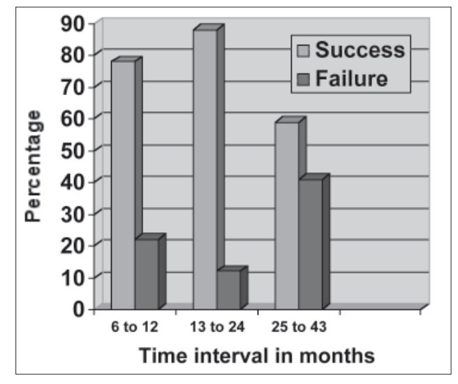
Figure 3. Success of pulpotomies as a function of follow-up time.