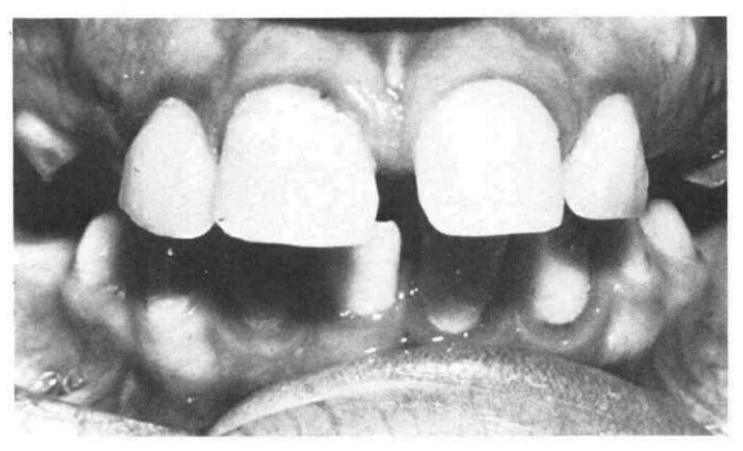
Figure 7. Esthetic improvement with custom laminate veneers.

Anticonvulsant drug therapy is another factor which could influence the findings in this case due to the effect of anticonvulsant therapy on calcium metabolism.<sup>28</sup> Patients receiving anticonvulsant therapy, especially diphenylhydantoin, exhibit a deficiency in 25-OHD<sub>3</sub> resulting in a decreased level of serum-calcium.<sup>18,29-33</sup> Severe hypocalcemia is seen in these patients