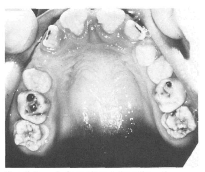
Figure 3. Generalized enamel hypoplasia-maxillary arch.

described by Demirjian, et al.,<sup>5</sup> utilizing periapical radiographs, and was confirmed by the method described by Marshal, utilizing panoramic radiographs<sup>6</sup> (Figure 5).