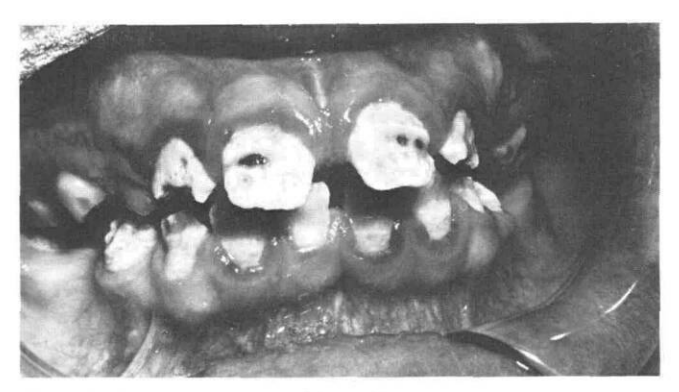
Figure 1. Generalized enamel hypoplasia.

The patient was referred to the Pedodontic Department at the University of Iowa for evaluation and treatment of the hypoplastic dentition. An investigation into the family history revealed no evidence of hypoparathyroidism or any dental disorders of a similar nature in any of the siblings or relatives going back three generations. The dental findings were: moderate to severe hypoplasia of the permanent dentition, very mild hypoplasia of the remaining primary dentition, and dental caries and shortened roots of the maxillary incisors which exhibited a significant degree of mobility (Figures 1-6B). The child exhibited dental delay as evidenced by the dental age which was calculated to be approximately 11 years, 6 months by the method