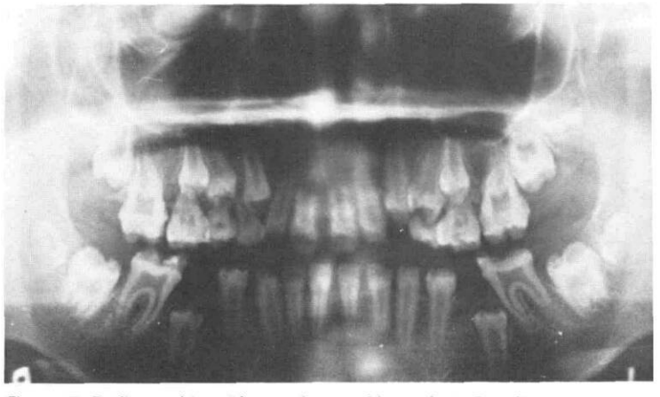
Figure 5. Radiographic evidence of enamel hypoplasia-Panelipse.

The parathyroid glands produce parathyroid hormone which acts to regulate the balance of calcium