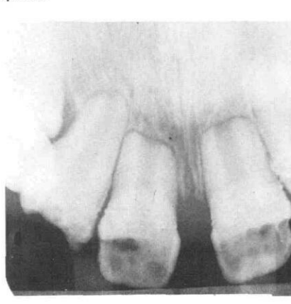
Figure 2. Radiographic evidence of enamel hypoplasia and shortened roots.