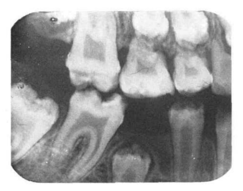
Figure 6B. Radiographic evidence of enamel hypoplasia-Bitewing (right).

Figure 6A. Radiographic evidence of enamel hypoplasia-Bitewings (left).