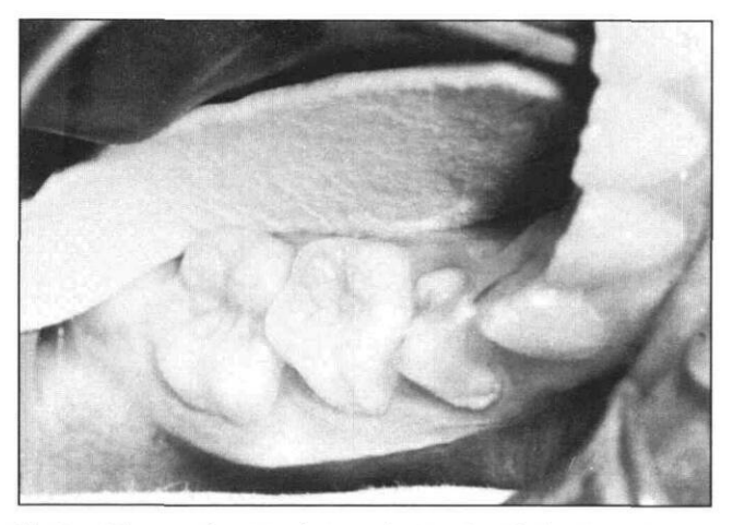
Fig 1c. The quadrant isolation obtained with the Vac-Ejector and Dri-Aid placed in the facial vestibyle and on the lingual surface of the tooth.

placement in the morning, and placed sealants without assistance in the afternoon, using a gel etchant and lightcured sealant material (Concise<sup>®</sup> Light Cured, 3M Dental Products Division, St. Paul, MN).