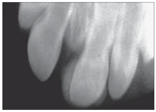
Fig 2. Occlusal radiograph, exhibiting fine, granular opacities around the crown of the central incisor

with this gingival lesion. During the removal of the soft tissue, a chalky white material was discharged. The primary central incisor was exposed, demonstrating a normal-appearing crown, and the surrounding tissues were curetted to remove the gritty substance. All tissue was submitted for histopathologic examination and the surgical site was allowed to heal by secondary intention.