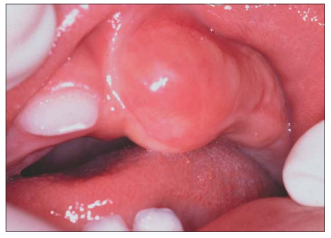
Fig 1. Gingival swelling associated with an unerupted maxillary central incisor

An 11-month-old Hispanic boy was referred by an emergency room physician for the management of a gingival abscess that had been increasing in size for one month. This healthy and normally developing infant was in the 75<sup>th</sup> percentile for height and weight. The gingival swelling was described as being painful and was nonresponsive to amoxicillin. According to his parents, the lesion was beginning to interfere with eating and drinking. Furthermore, the child was constantly rubbing or hitting the gums with his toys, due to teething problems. Clinical examination revealed a 2X1.5-cm gingival enlargement of the anterior left maxillary alveolar mucosa, which was spongy to palpation