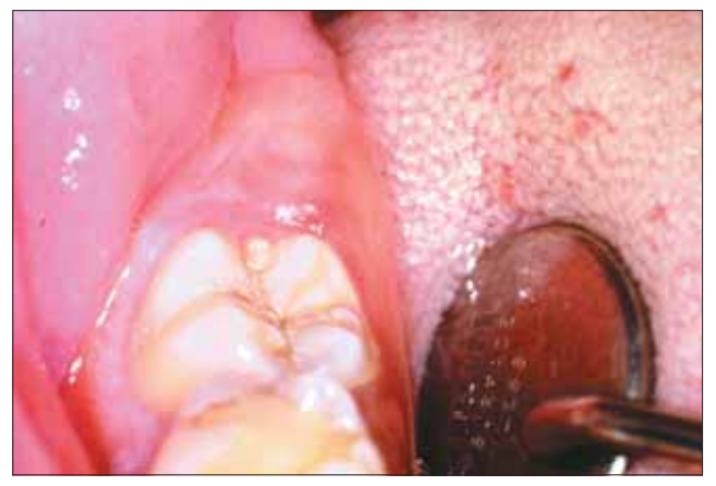
Fig 3. Eruption of the molar six weeks following the surgical removal of the gingival lesion