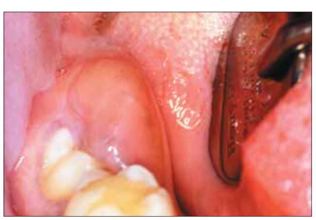
Fig 1. Dome-shaped gingival enlargement interfering with the eruption of the mandibular second molar

Received August 13, 2001 Accepted September 15, 2001