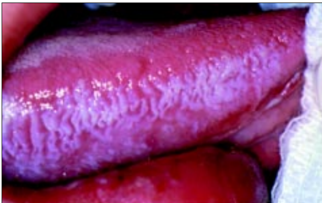
Fig 7. Oral hairy leukoplakia of lateral border of tongue.