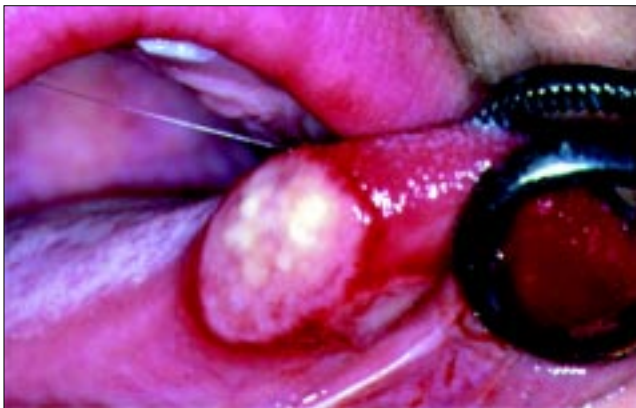
Fig 2. Necrotizing ulcer of lateral border of tongue.