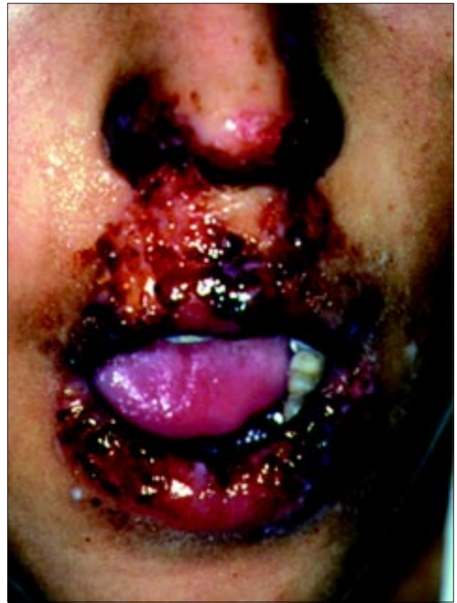
Fig 3. Diffuse perioral herpes simplex viral infection.