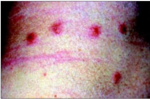
Fig 9. Scabies that was occupationally acquired by a dental team member from an HIV-infected child.

in time, in contrast to cumulative oral lesion prevalence in longitudinal studies. The higher number of children with oral lesions is consistent with lack of universal antiretroviral drug therapy and a declining immune status over time. Laboratory-based prognostic markers utilized in developed countries for following HIV disease progression are not available. Because the Romanian population studied had a mean age of 8.8 years (range 6 to 12 years), these children actually may represent children who, with proper HIV treatment and infectious disease prophylaxis, would have had mild to moderate immunosuppressed states. With lack of therapy, no doubt, those with the most aggressive disease would not have survived infancy or early childhood. In addition, a sampling bias may have occurred in this study because the director of the pediatric AIDS clinic selected the children to be evaluated and receive dental care.