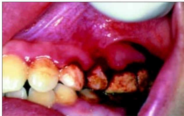
Fig 8. Hemorrhagic gingivitis due to idiopathic thrombocytopenia purpura.