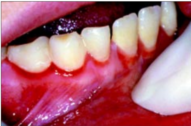
Fig 6. Linear gingival erythema.