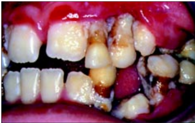
Fig 5. Necrotizing ulcerative periodontitis.