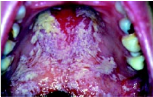
Fig 1. Pseudomembranous candidiasis with diffuse palatal involvement.