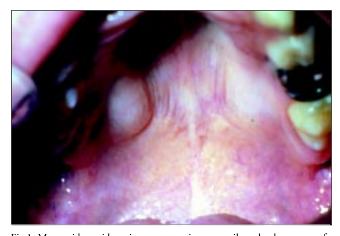
Fig 1. Mucoepidermoid carcinoma presenting as a unilateral enlargement of the posterior hard palate.

An 8 year-old white boy was referred for the evaluation of a soft tissue enlargement of the palate, which had been slowly increasing in size for the past 9 months. Clinical examination revealed a localized submucosal nodule of the right posterior hard palate, measuring 2.0 X 1.5 cm (figure 1). The mucosal surface was smooth and intact with a faintly blue translucency. The asymptomatic swelling was soft and compressible with