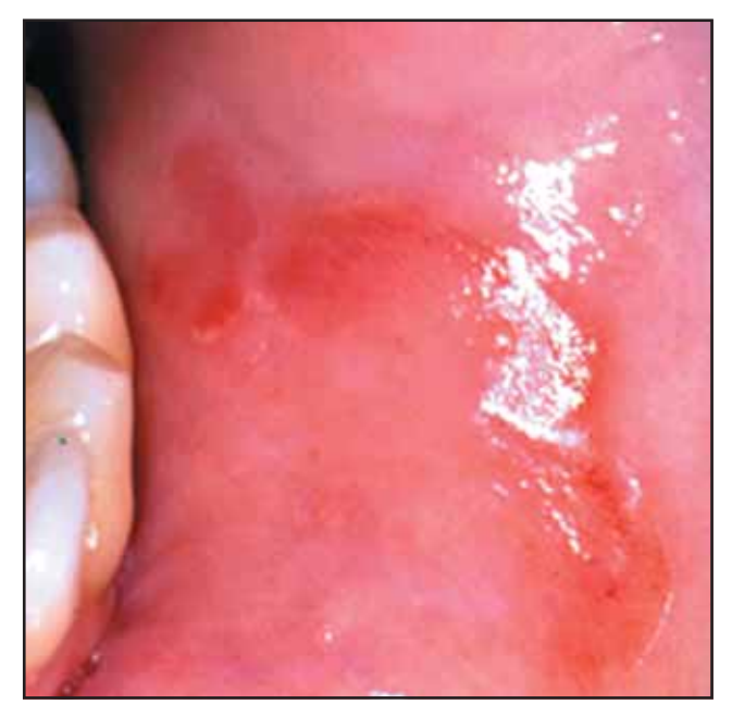
Fig 2 b. Ectopic erythema migrans appearing as coalescing, red patches of the anterior buccal mucosa, bilaterally.

tongue lesions, the lesion site and pattern is frequently changing. Although often asymptomatic, most individuals are aware of mucosal roughness, while tenderness and a burning sensation may accompany this condition. Spicy or acidic foods and beverages and certain oral hygiene products may be irritating when the lesions are present.