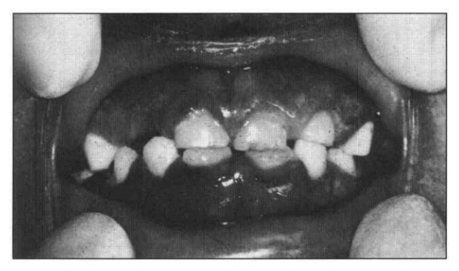
Fig 1. Plaque and materia alba around gingival margin of teeth with resultant decalcification and smooth surface caries development.

The child was initially referred to the dental service at 18 months of age because of oral pain and recurrent oral soft tissue ulcers. The latter were present on the gingiva, mucobuccal folds, and palate. By history, the ulcers recurred in 30-day cycles. An oral suspension of equal parts of milk of magnesia, elixir of Benadryl<sup>™</sup>