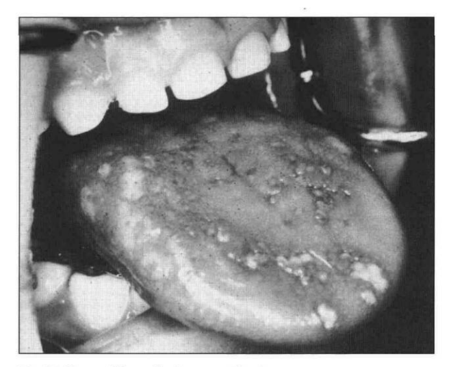
Fig 2. Herpetiform lesions on the tongue.