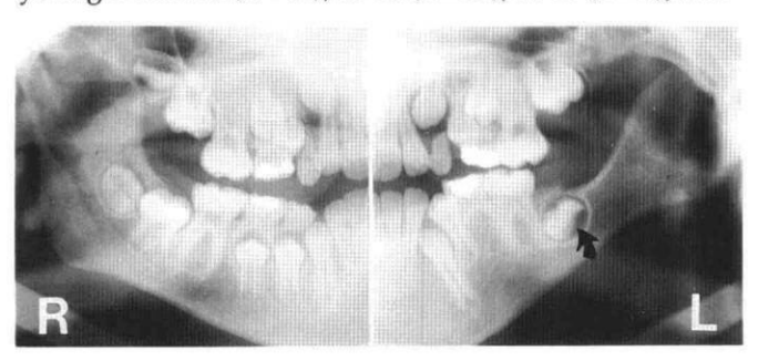
FIG 1. Comparison between delay in tooth development on the affected (A) and the unaffected side (N/A) in subjects with HFM grouped by age (P < 0.001, significantly different).

Tooth development and agenesis were studied in 60 patients (24 boys, 36 girls) with HFM treated at the Center for Craniofacial Anomalies, University of California, San Francisco. They ranged in age from 6 to 24 years and were divided into four groups (Fig 1): younger than 10 (N = 12); 10-13 (N = 35); 14-17 (N = 7); and