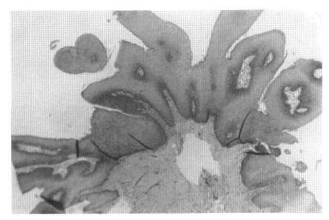
Fig 2. Histologic view of the smaller lesion.

Some of the cells contained irregular hyperchromatic nuclei. The subepithelial connective tissue showed a few mononuclear inflammatory cells. No viral inclusions were identified. The histologic examination confirmed the diagnosis of oral condyloma acuminatum.